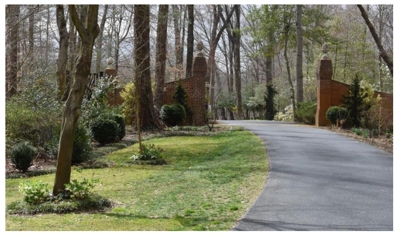
Entry Gate at Hidden View Farm