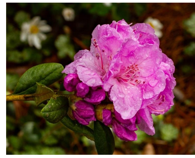
'Gable's Early Bird'