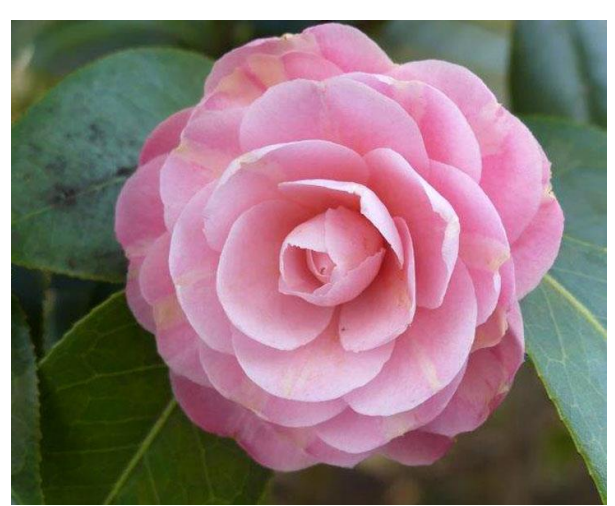
Camellia 'Pink Perfection'