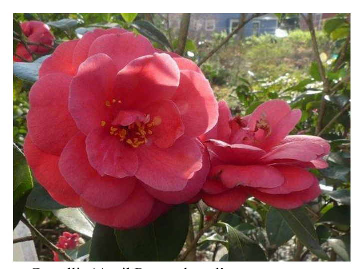
Camellia 'April Remembered'