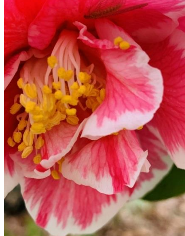
Magnolia 'Stellata' & Camellia 'Herme'