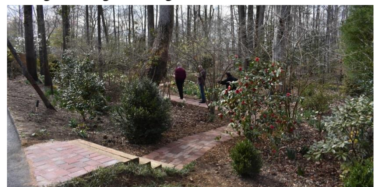
Richard's New Walk

We were very impressed with a new walkway Richard had just installed days before. Using weathered brick and curving it through existing beds, it looked decades old.