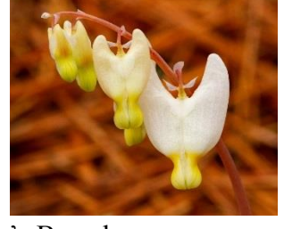
Trillium sessile & Dutchman's Breeches