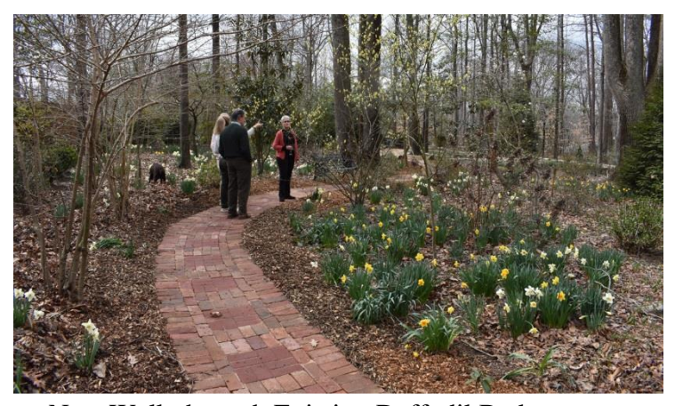
New Walk through Existing Daffodil Beds D. Hyat