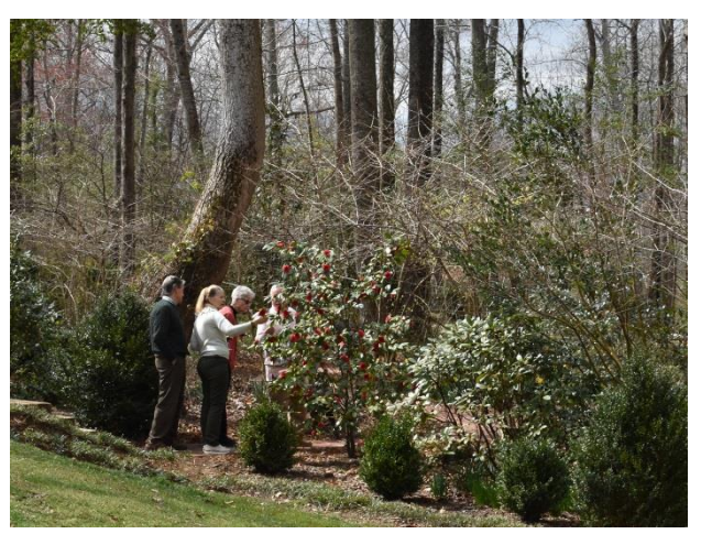
Admiring the Camellias