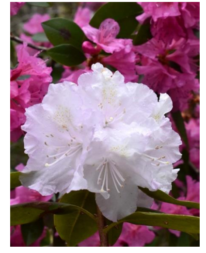
'Kehr's White Ruffles' D. Hyatt

Have you made an arrangement with flowers from your garden? Please send me a picture! -DH