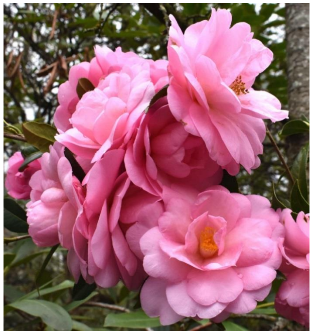
Camellia 'Pink Icicle'