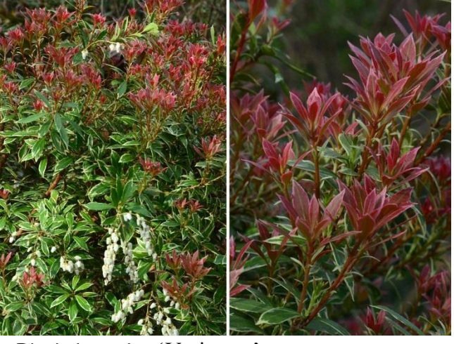
Pieris japonica 'Variegata'