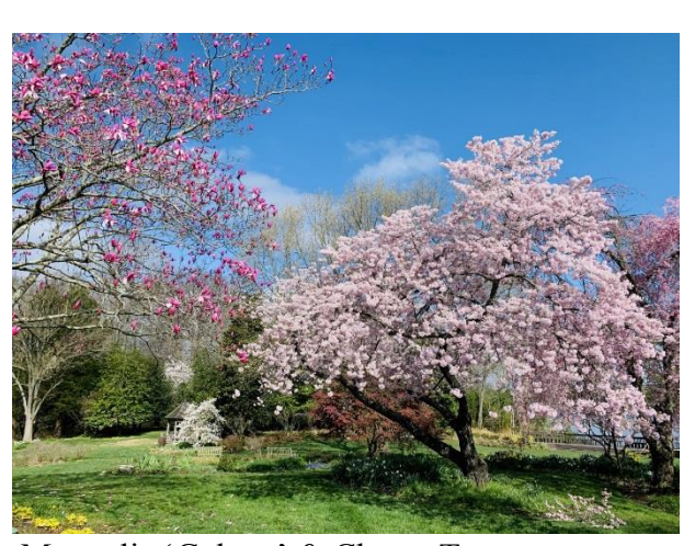
Magnolia 'Galaxy' & Cherry Tree Londontown