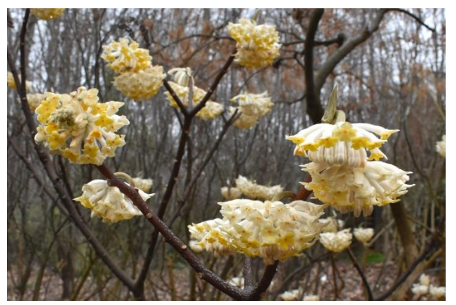
Edgeworthia chrysantha 'Snow Cream'