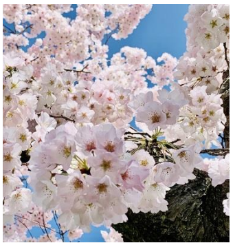
Camellia Sport & Yoshino Cherry Londontow

I took some photos of a few rhododendrons that are blooming now. My first elepidote to bloom was R. degronianum ssp. heptamerum . Still in protest, I use its former name, R. metternichii . Much shorter!