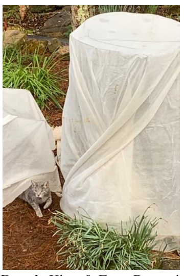
Doug's Kitty & Frost Protection