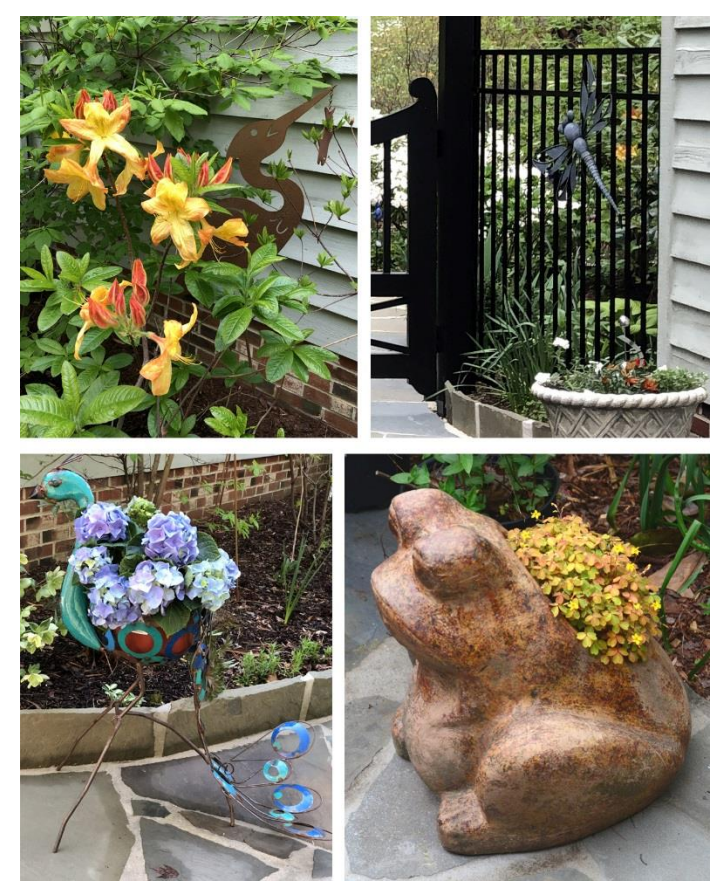
Some of Carol's Whimsical Garden Sculptures