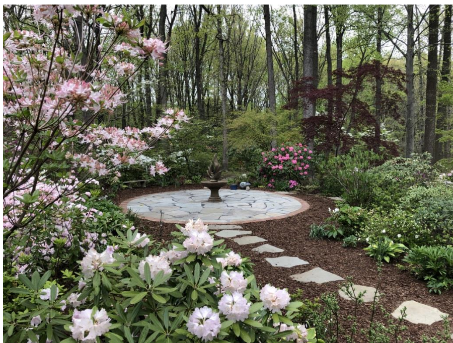
Carol's New Circular Patio and Fountain