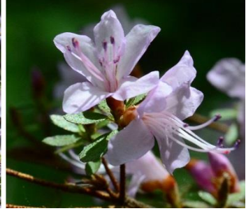
Rare Azalea, Rhododendron serpyllifolium from Japan