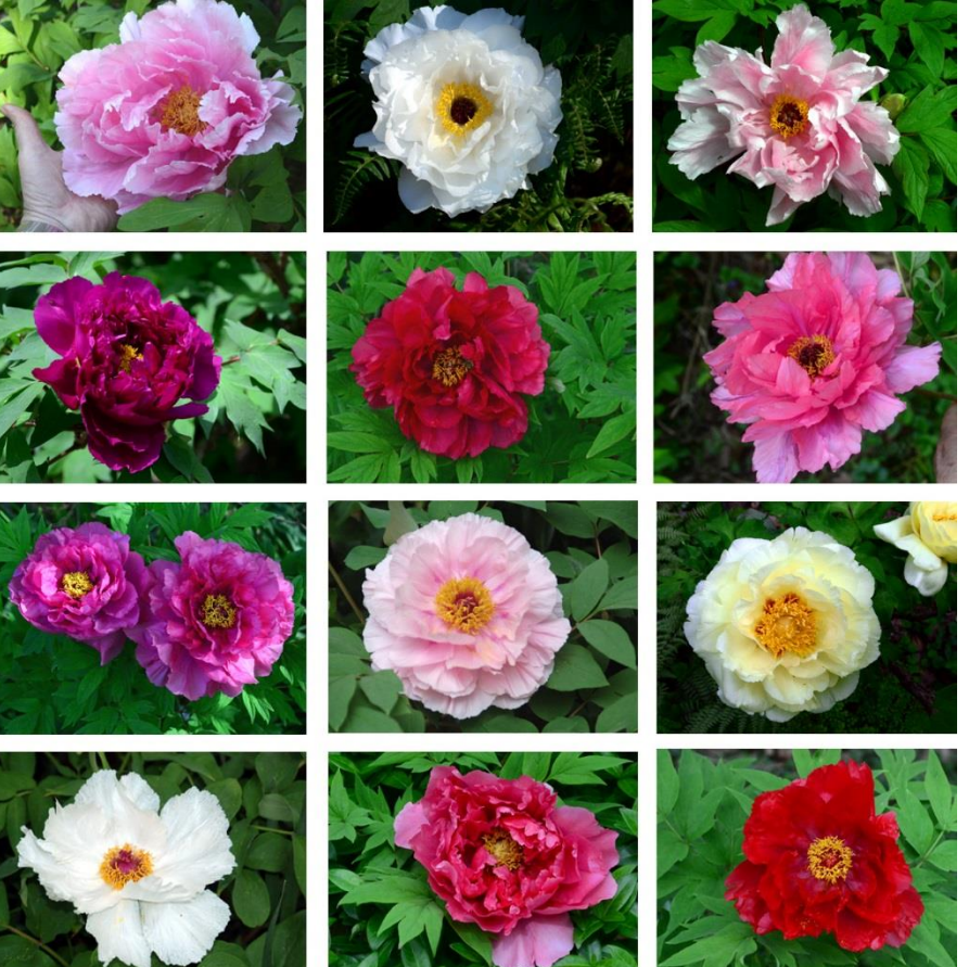
Variations of Tree Peony Flowers in the Hyatt Garden Hyatt

Tree peonies make great companions to rhododendrons since their huge flowers, often 8 to 10 inches across, are in scale with those large trusses. A real plus... Deer don't eat tree peonies!