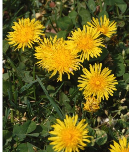
Taraxicum officianalis Hyatt