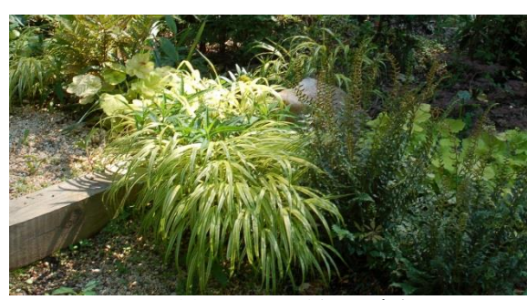
Hakonechloa macra 'Aureola'