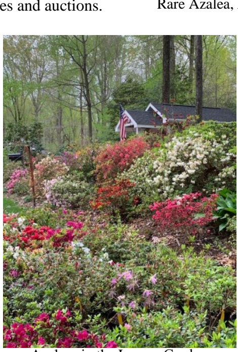
Azaleas in the Larson Garden