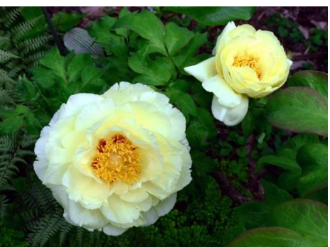
Tree Peony 'High Noon'