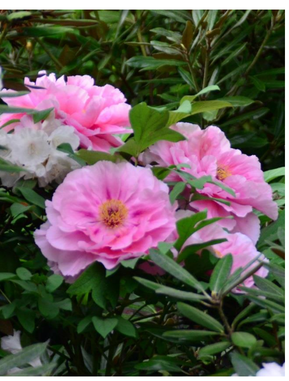
Tree Peony among Rhododendrons