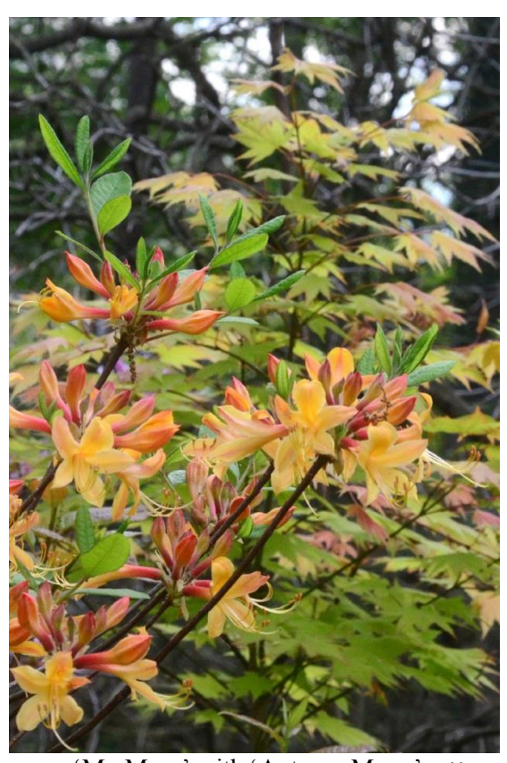
'My Mary' with 'Autumn Moon'