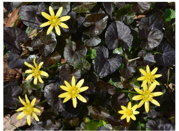
Ranunculus ficaria 'Brazen Hussy' Hyatt