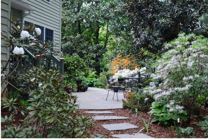
Main Backyard Patio Adjacent to Carol's Kitchen

Look carefully in Carol's garden or you may miss her many art objects, whimsical sculptures, and planters. There is a large black dragonfly on the fence as you enter the backyard, a copper heron hiding behind 'Arneson's Gem', a peacock strutting at the edge the patio with a blue hydrangea, and my favorite, a frog planter hiding under the patio furniture. Also look for an azalea with very tiny leaves and ½-inch flowers, R. serpyllifolium . So cute!