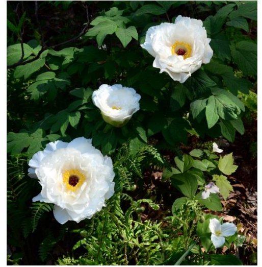
Hyatt Tree Peony & Trillium