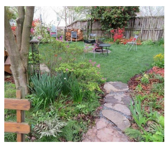
Backyard & Entertainment Areas Bullock