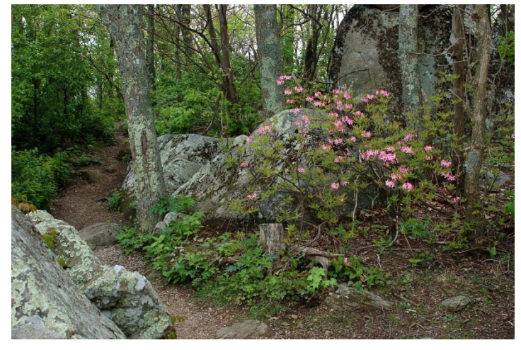
R. prinophyllum on Apple Orchard Mountain Hyatt