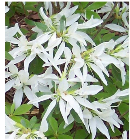
'Wagner's White Spider' (Long Pointed Petals)