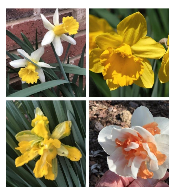
Daffodils, Old and New