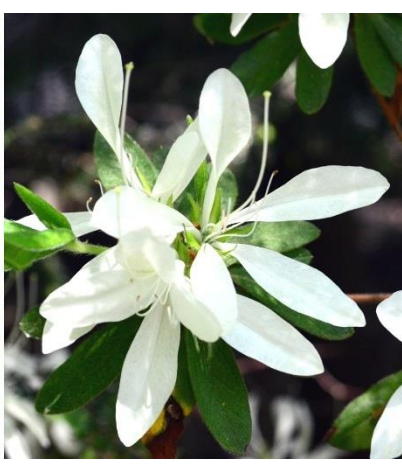
'Primitive Beauty' Hyatt (Long Spoon Shaped Petals)