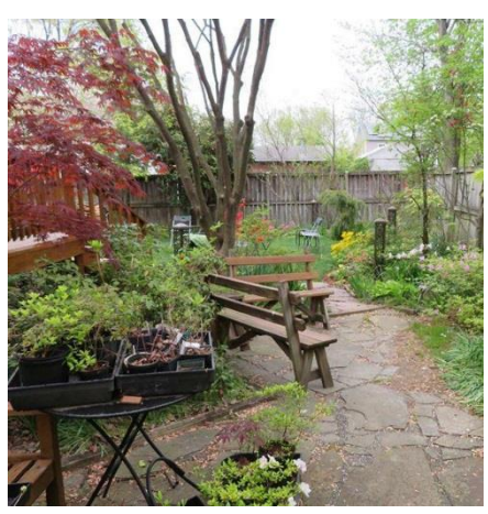
Plants to Repot Bullock