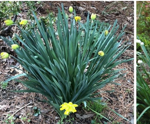
Heirloom Double Daffodil Segree