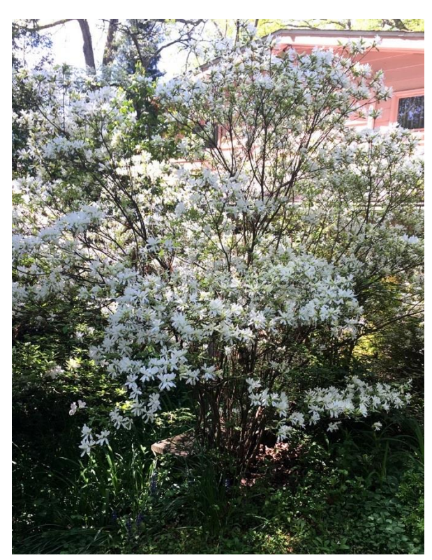
'Nannie Angell' in Dianne Gregg's Garden Gregg