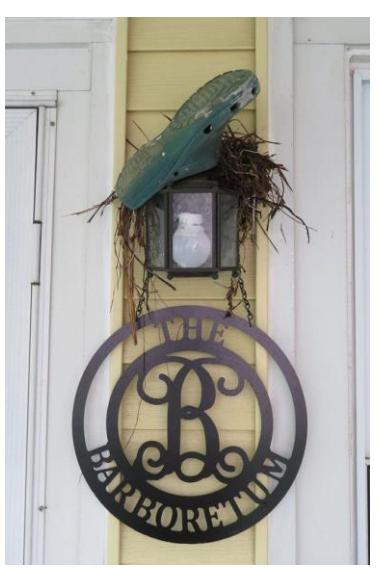
The Barboretum Bullock and Bird Nest