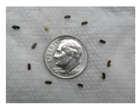
Asian Ambrosia Beetles

Then put some soapy water in the bottom of the soda bottle since that will trap the insects as they fly into the trap, and fall to the bottom. Check the traps often for insects.