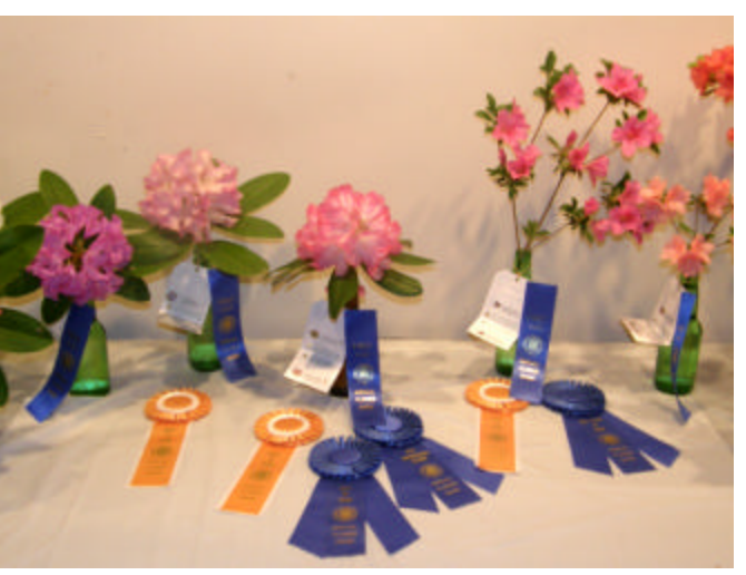
2008 Flower Show Winners

Examples: 'Glacier', 'Ben Morrison', 'Coral Bells', 'Quakeress', 'Pink Pearl', 'Dream', 'Nancy of Robinhill'