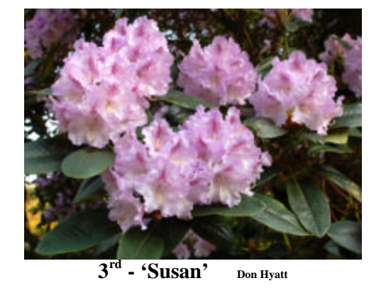
Potomac Valley Chapter ARS Photo Contest