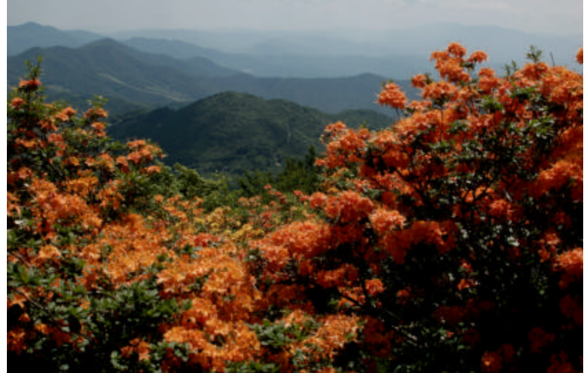
1<sup>st</sup> & Best in Show - "Calendulaceum at Engine Gap" Don Hyatt Category III: Other