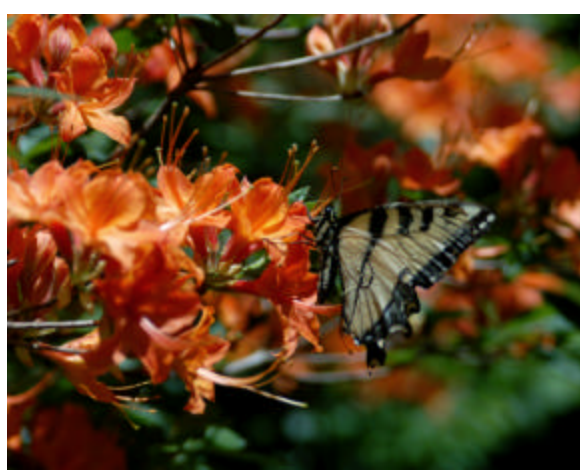
1<sup>st</sup> "Swallowtail at Hooper Bald" Don Hyatt