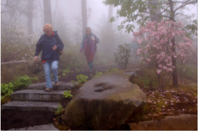
In the above photo, Sandra McDonald and Anita Burke are walking along a garden path in the mist.

After lunch at a Chinese buffet in Brevard, we went to the Southern Highlands Reserve near Lake Toxaway. This 170-acre private wildflower preserve is on the top of the mountain and only open to academic and horticultural professionals by invitation. I was totally blown away by the landscaping and stonework.