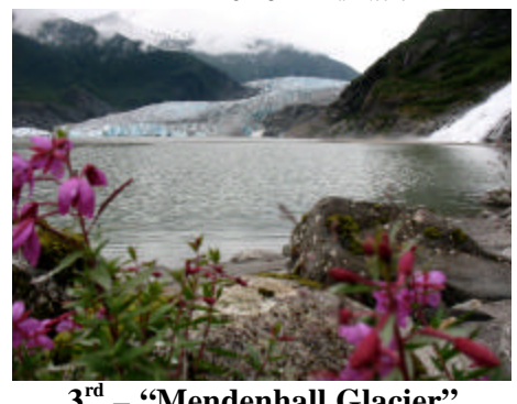
3<sup>rd</sup> – "Mendenhall Glacier"