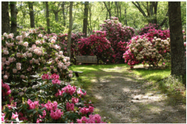
The Dexter Display Garden at Heritage

The Sandwich Club Plant Auction and Meeting will be held on Saturday, June 5^{h} , 2010 from 10 AM until 1:00 PM at the Heritage Museums and Gardens, 67 Grove Street, Sandwich, MA. This is the former home of Charles Dexter and has a lovely landscape with mature rhododendrons.