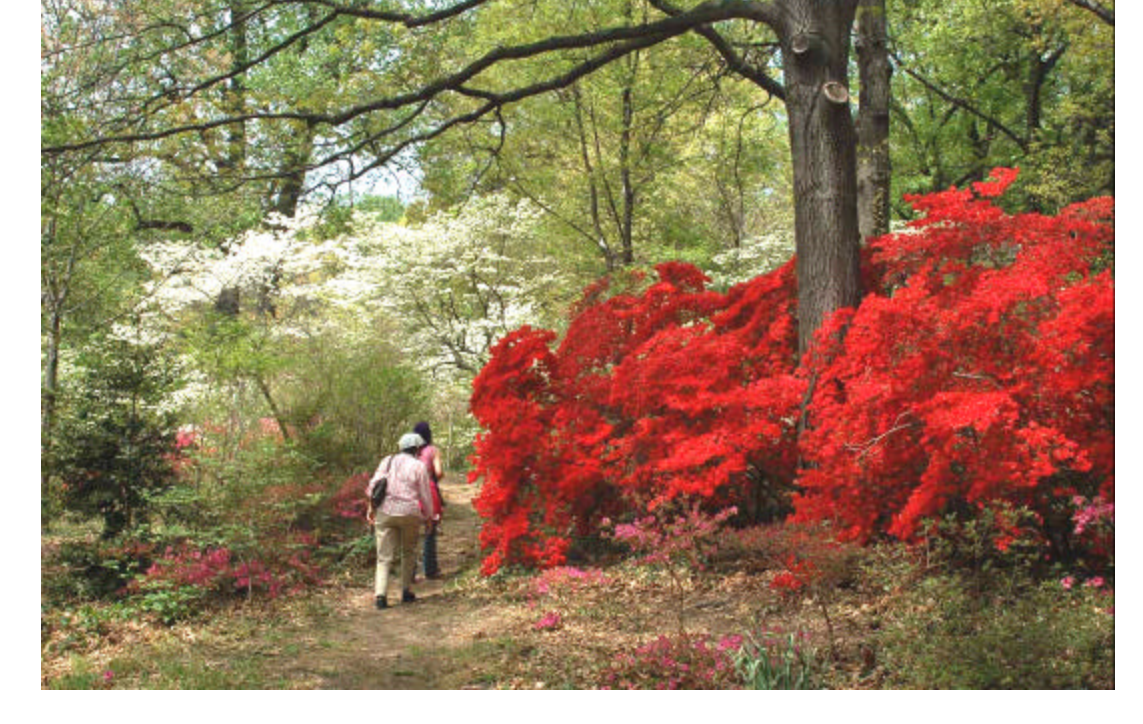
Save the Azaleas!