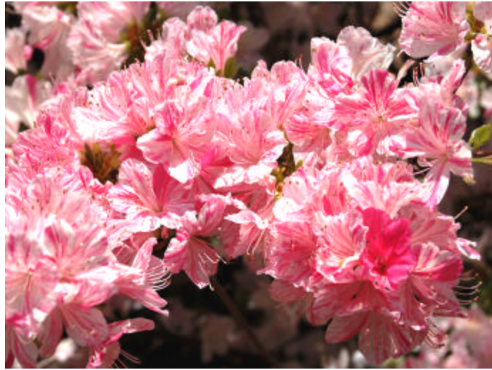
What We Stand to Lose