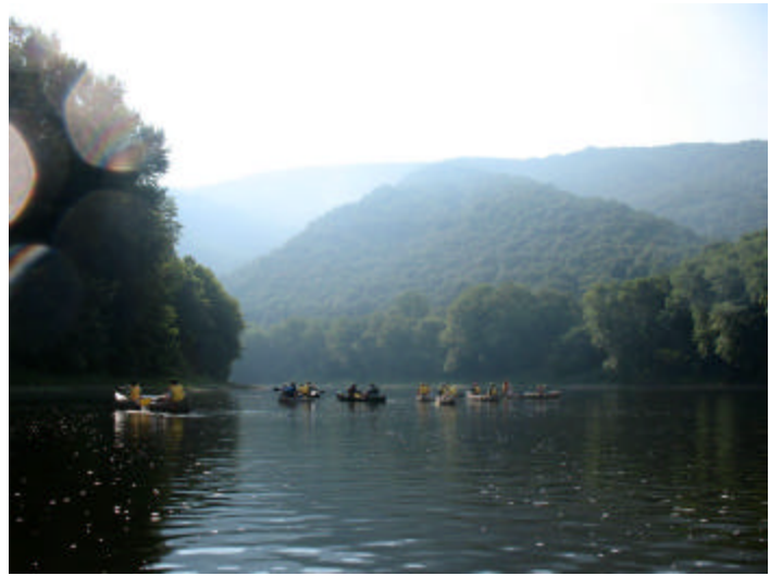
James Wallenmeyer – Troop 457, Upper Potomac