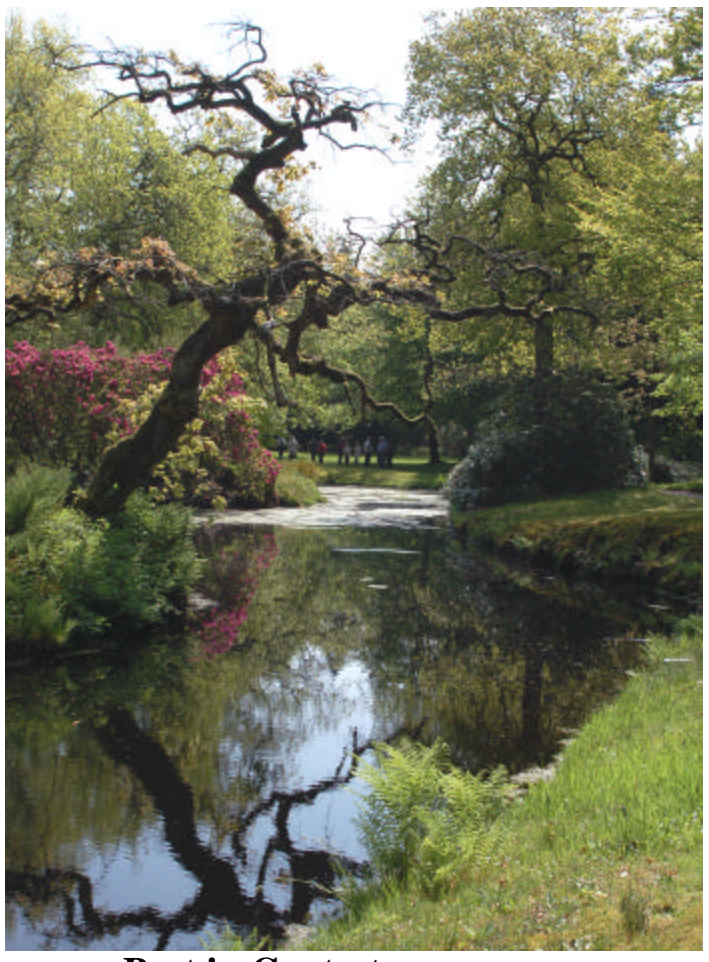
Best in Contest: Don Hyatt Lütetsburg Castle Gardens, Germany