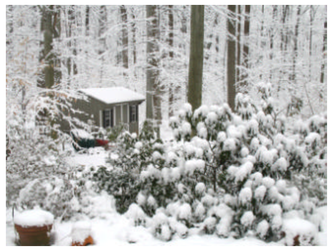
Bill Wallenmeyer - Snow