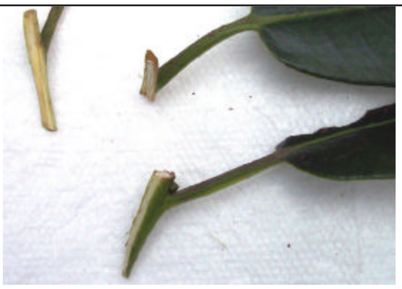
Try Some Leaf-bud cuttings too