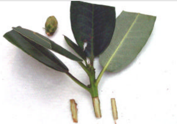
Trim leaves; Remove buds; Wound stem