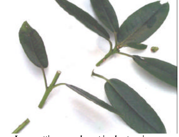
Long cuttings may be cut in shorter pieces

I insert the cuttings in pots containing a porous medium of equal parts peatmoss and perlite with a bit of coarse sand. The medium should be damp but not too wet since excess moisture can encourage rot. I enclose each pot in a clear plastic bag and place these minigreenhouses under my fluorescent lights that stay on for 18 hours per day. Cuttings should require no water or care for months. I keep them under the lights until new growth emerges the next spring and then transplant. Some varieties root in 2 to 3 months but stubborn types might take a year. I often wait until the next spring to repot.