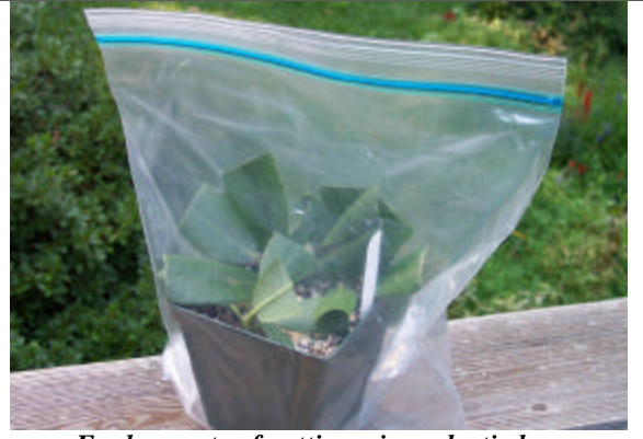
Enclose pots of cuttings in a plastic bag