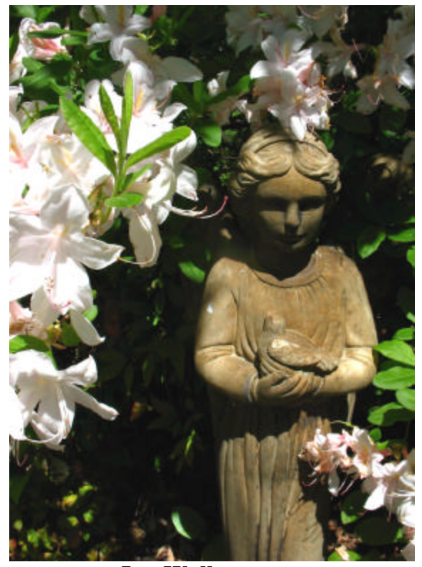
Jon Wallenmeyer Angel in White Lights

These photographs were selected by popularity vote as the favorites in our annual photo contest. Don Hyatt's picture of garden reflections he saw on a tour in Germany was judged the Best in Contest.