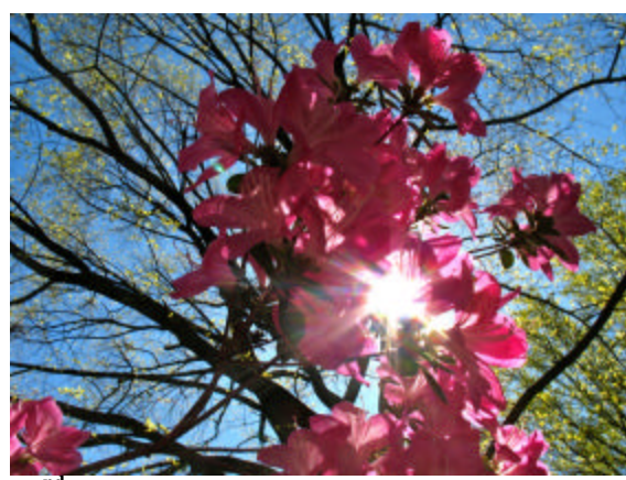
2<sup>nd</sup> Category 1: Jon Wallenmeyer 'Dayspring'