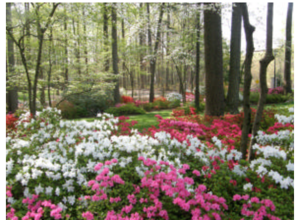
2<sup>nd</sup> Category 2: Bob McWhorter Azaleas #5