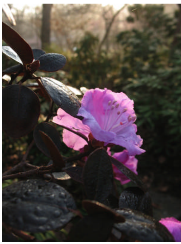
1<sup>st</sup> Category 1 and Best in Show Jon Wallenmeyer 'Northern Starburst'