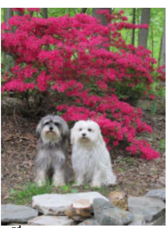
2<sup>nd</sup> Category 3: Tom Chapin Necco & Taffy