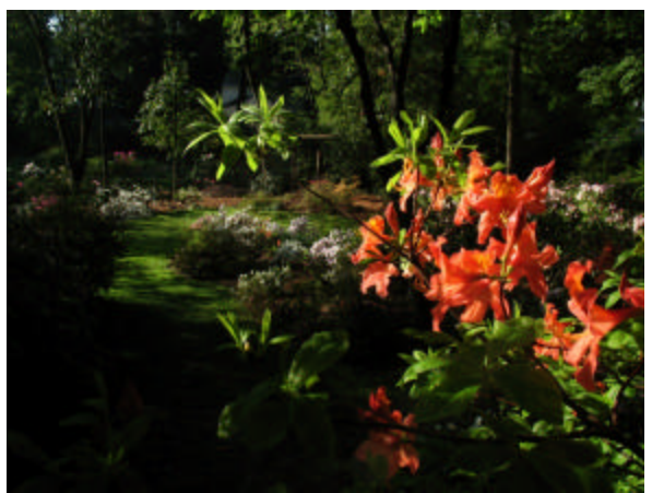
1<sup>st</sup> Category 2: Jon Wallenmeyer 'Mt. St. Helens' View