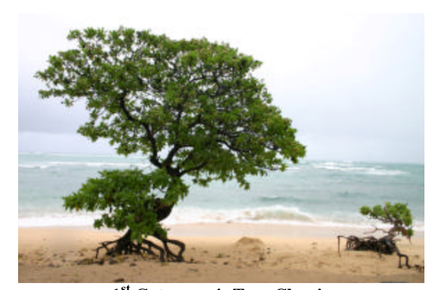
1<sup>st</sup> Category 4: Tom Chapin Tree on Beach