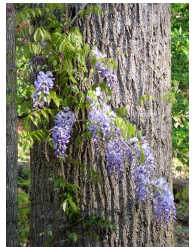
2 nd Other: Tammy Chapin Wisteria