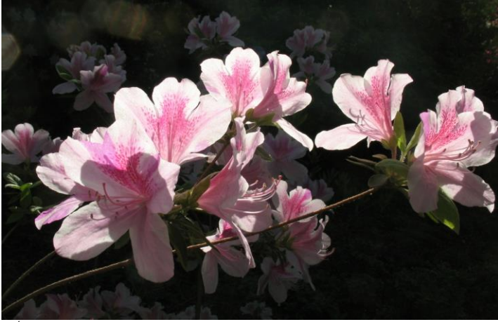
1 st Flowers, Best in Contest Tie: Jon Wallenmeyer 'Dancing Butterflies'