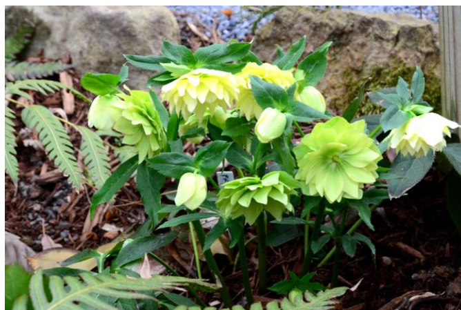
Double Hellebore Hybrid

H. orientalis , H. hybridus , 'Ivory Prince', 'Pink Frost'