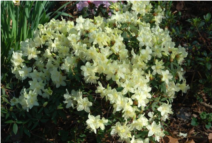
Dwarf Yellow Lepidote Species: Rhododendron keiskei

This section left blank on the Internet version due to privacy issues