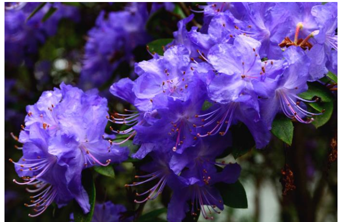
Tall Blue Lepidote Species: Rhododendron augustinii