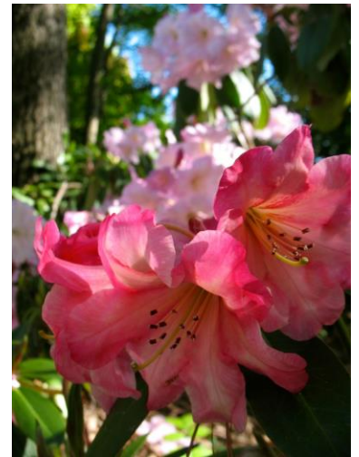
2 nd Flowers Tie: Jon Wallenmeyer, 'Dexter's Orange'