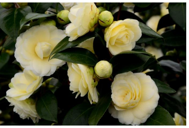
Pale Yellow Camellia 'Lemon Glow'