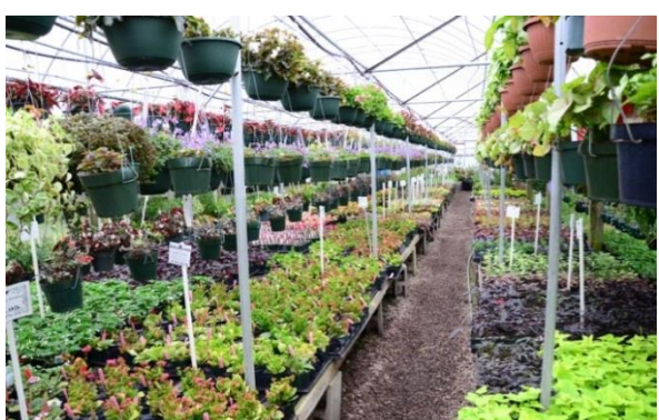
Vista in a Greenhouse at Big Bloomers