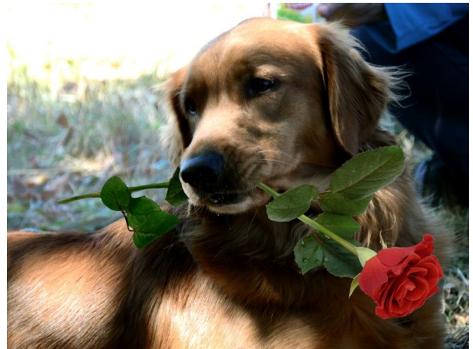
Will you accept this rose?

Refreshment Duty: Persons whose last names begin with L through Z are asked to bring something for the refreshment table.