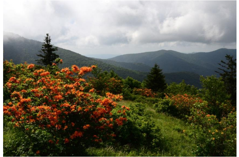
1 st Scenery, Best in Contest: Don Hyatt "Calendulaceum at Engine Gap"