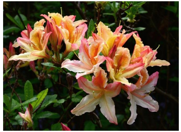
1 st Flowers (tie): Don Hyatt "Knap Hill Hybrid"