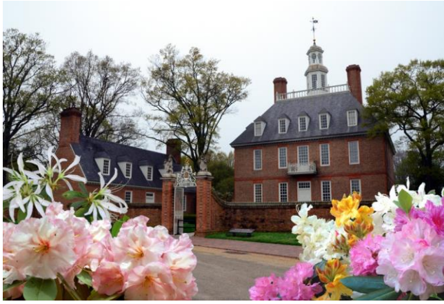
Williamsburg Convention: April 20- 24, 2016