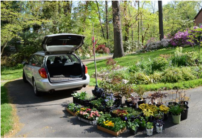
Typical Nursery Trip Haul