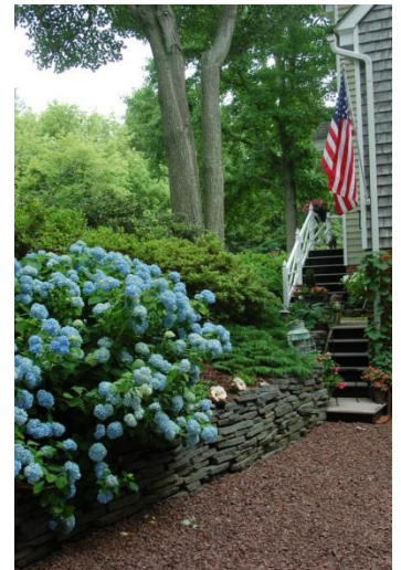
3 rd Other: Dan Neckel "Lewes Hydrangeas"