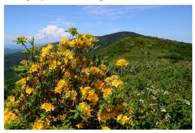
2^{nd} – Flame Azalea on Roan Mt. (Hyatt)