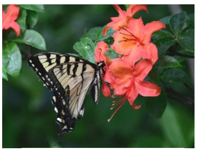
2^{nd}-Butterfly\ on\ \textit{R. cumberlandense}\ (Hyatt)