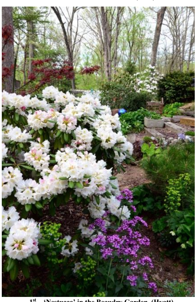
1st - 'Nestucca' in the Beaudry Garden (Hyatt)