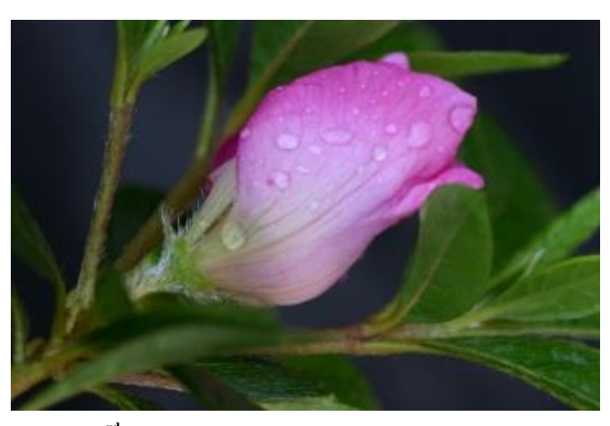
3<sup>rd</sup> - Azalea Bud on HS 'Nightingale' (Beck)