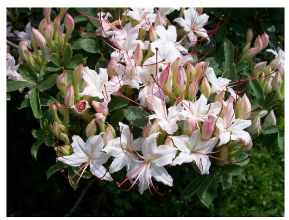
Wayah Bald -R. arborescens