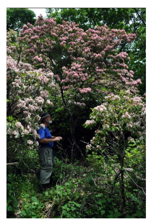
Wine Spring Bald Kalmia