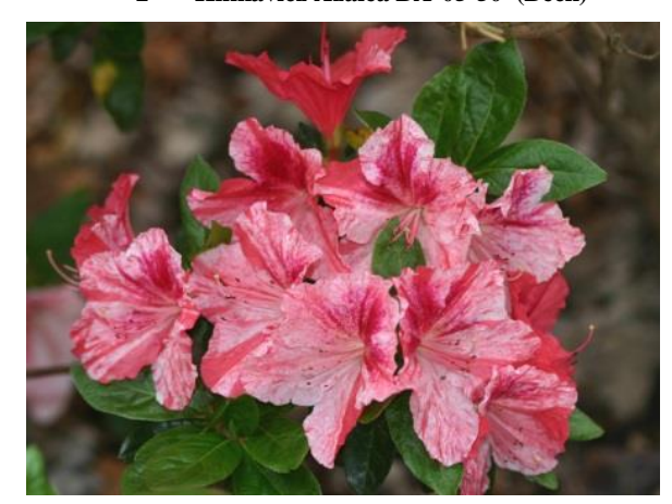
2<sup>nd</sup> – Klimavicz Azalea BA-05-54 (Beck)