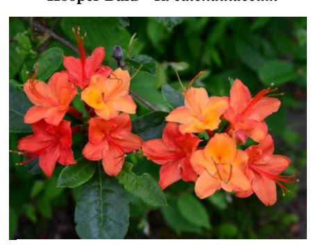
Hooper Bald – Bicolor Flame Azalea