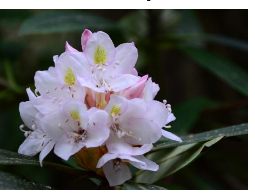
Cades Cove / Gregory Trail – R. maximum