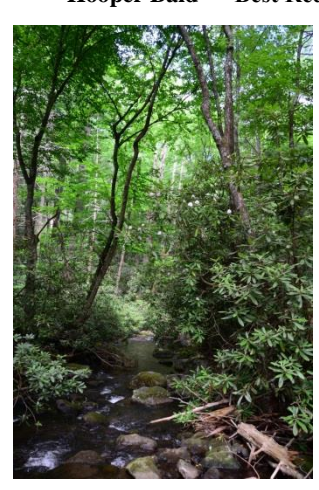
Gregory Trail - Forge Creek