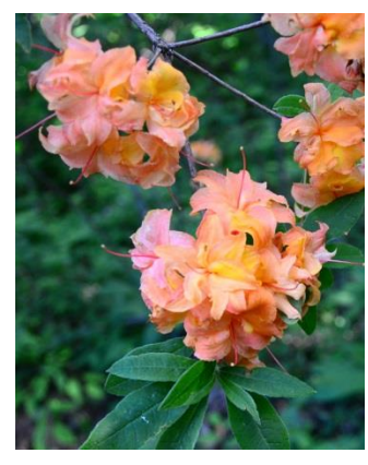
Wayah Bald - Double Flame Azalea