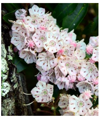
Wayah Bald - Kalmia