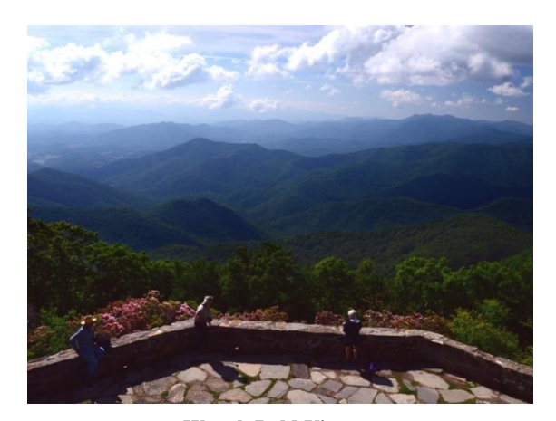
Wayah Bald Vista