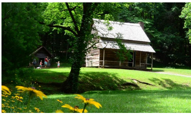
Rustic Cabin in Cades Cove

The next day we drove to Hooper Bald and I could make the hike to see the calendulaceum . It is a leisurely walk on a gravel path for about a quarter of a mile which was no problem in sandals. The azaleas were spectacular, as always.