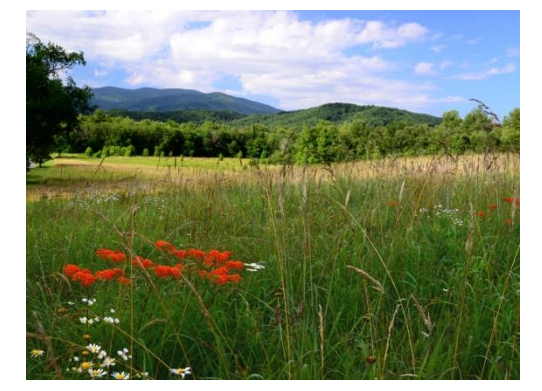
Cades Cove Vista - Butterfly Weed