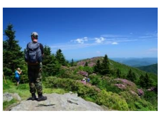
3<sup>rd</sup> – Roan Hikers (Hyatt)