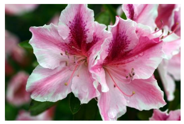
2<sup>nd</sup> – Klimavicz Azalea BA-05-50 (Beck)