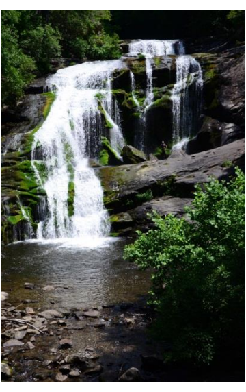
Hooper Area – Bald River Falls