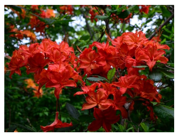
Hooper Bald – "Best Red" calendulaceum