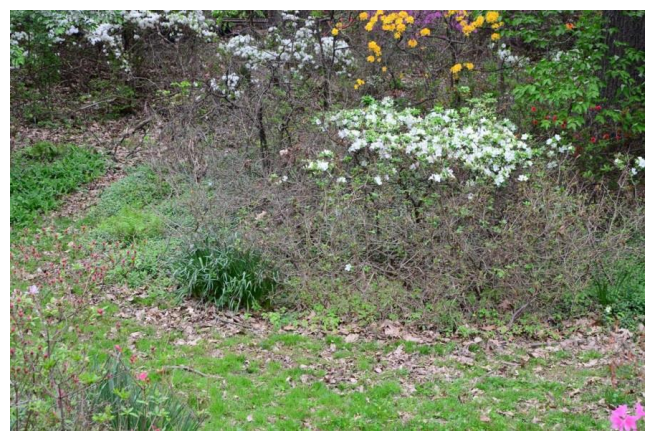
Hyatt Garden after Deer Damage - May 2015

It is important to protect young trees from bucks during rutting season. By September, I try to construct a cylinder of wire around the bottom 4 ft of any small tree that has a trunk diameter less than 6 inches. It keeps the bucks from rubbing the bark off those trees as they try to rid their antlers of the felt that covered them during the summer.