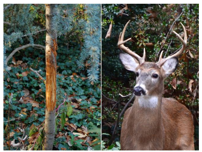
Bark Damage to a Blue Atlas Cedar by Deer Rubbing

Electric fences are very effective but in my suburban community with children and lawyers nearby, that is not an option. I have considered purchasing some of those electronic stakes like the Havahart 5250 Deer Repeller which cost about $50 each. An attractant lures the deer to the stake but as soon as it licks the surface, the deer gets a strong jolt of electricity. Those work briefly, but the deer soon learn to avoid them.