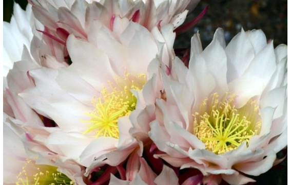
Cactus Blossoms (Echinopsis)