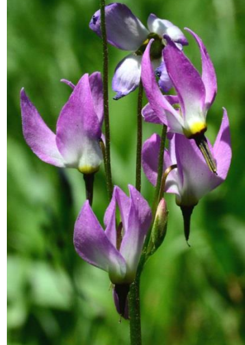
Shooting Star (Dodecatheon)