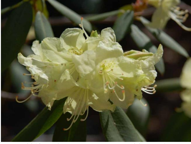
2018 Lepidote Rhododendron '24 Karat'