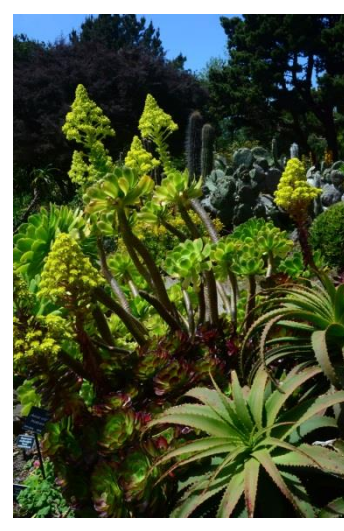
Flowering Succulent (Aeonium)