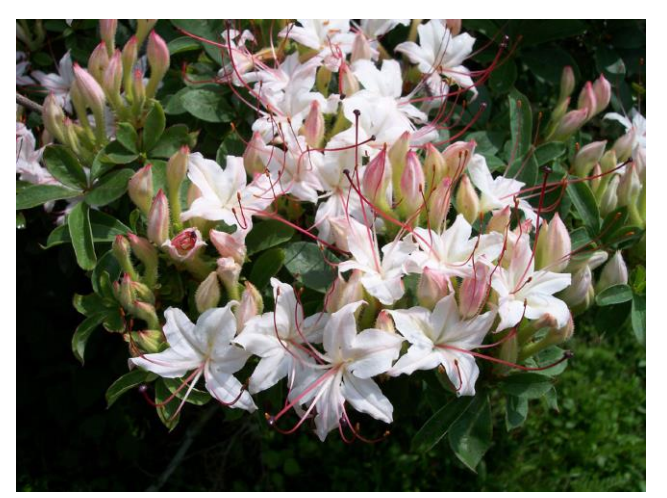
2018 Deciduous Azalea: R. arborescenss