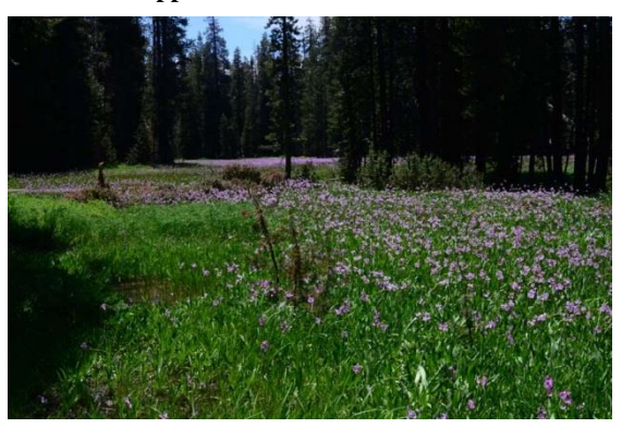
Wildflower Meadow (Dodecatheon)