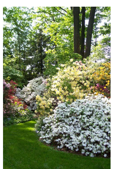
Hyatt Garden – May 2009

I have watched deer tastes change over the