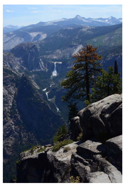
Glacier Point – Waterfall Vista