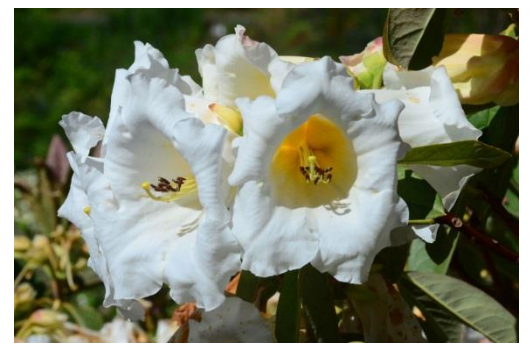
Rhododendron 'Mi Amor'