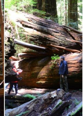
Fallen Redwood Trees