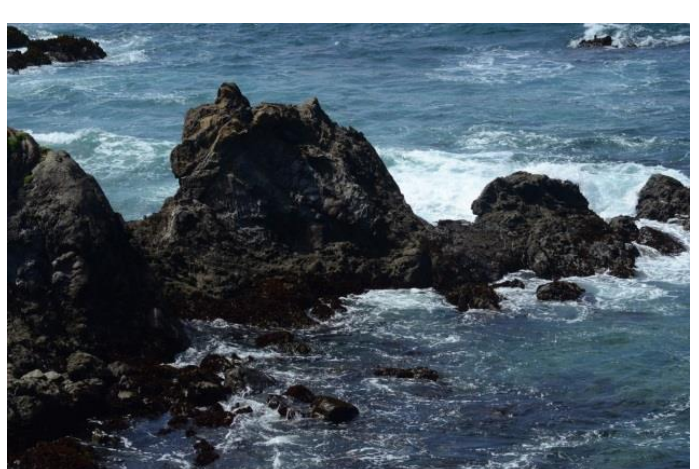
Pacific Ocean from the Coast Bluffs Viewpoint