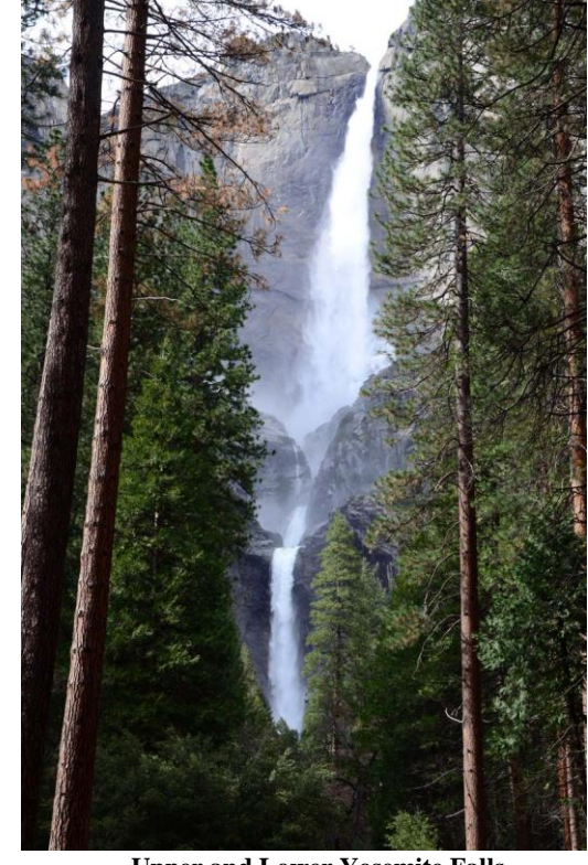
Upper and Lower Yosemite Falls