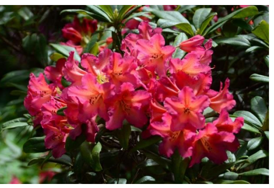
Rhododendron 'Golden Gate'