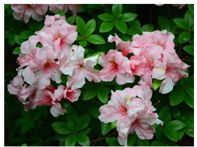
2018 Evergreen Azalea 'Dreamsicle'