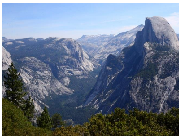
Half Dome from Glacier Point