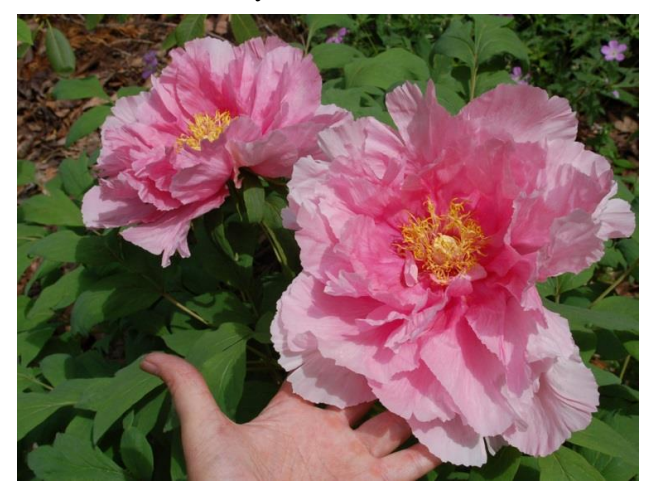
Tree Peonies seem to be Deer Resistant

Deer can also change their tastes from year to year. Plants I thought were deer resistant can become fodder at a later date. Some recent surprises included Christmas ferns and Lily-of-the-Valley. So far, deer have not eaten any of my tree peonies nor do they like my hellebores. However, young deer will often taste anything in the garden. Many times I have found the flower stalks of expensive double hellebore hybrids chewed off and spit out on the ground. The yearlings may not have liked the flavor of hellebores but they still ruined the blooms.