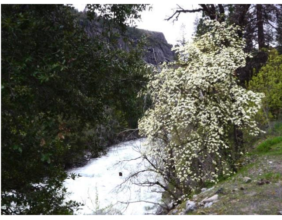
Merced River with Western Dogwood (Cornus nuttallii)