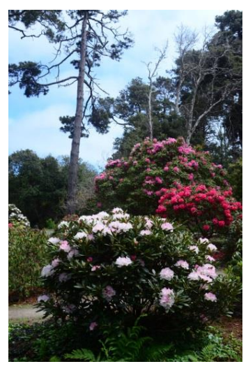
Rhododendron 'Noyo Snow'