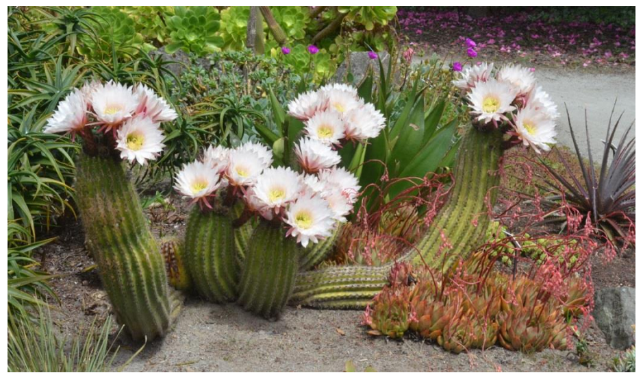
Cactus ( Echinopsis ) in the Mediterranean Garden