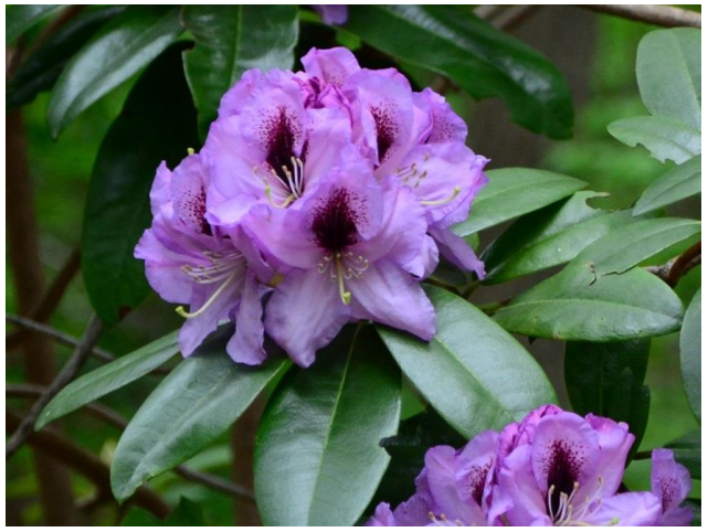
2018 Elepidote Rhododendron 'A. Bedford'

Every year we must select the Rhododendrons of the Year for our Middle Atlantic Region. This year, the ARS asked that we include input from Eastern Pennsylvania and New Jersey since their climate is similar to what we have in District 9. Below are the selections we made for 2018.