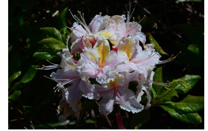
R. occidentale at Stagecoach Hills