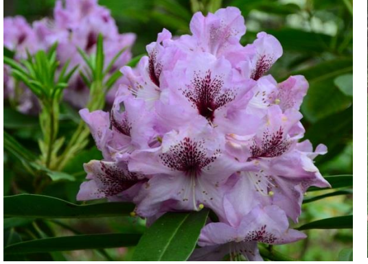
15. 'Great Smoky'