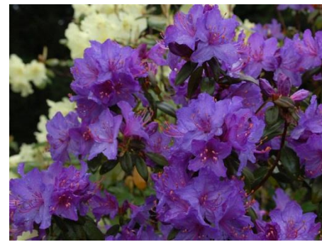
'Blaney's Blue' (2017)