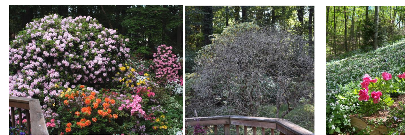
Hyatt Garden: 'Caroline' Before