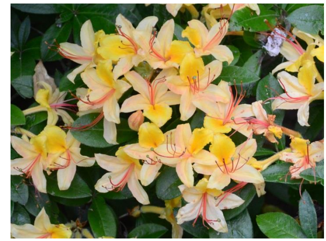
24. (cumberlandense x arborescens) WB - 1