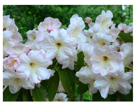
16. 'Hardy Loderi'