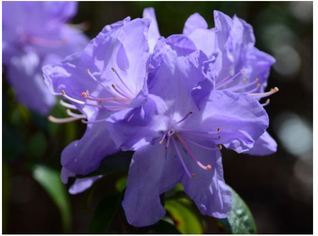
2019 Lepidote Rhododendron 'Rhein's Luna'