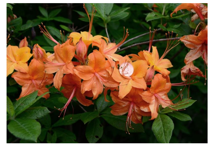
2. 'Hooper's Copper'

Seed Exchange: Below are some of the plants listed as seed sources in this year's exchange.