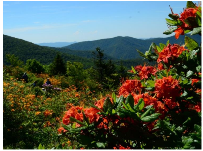
4. R. calendulaceum Roan Mix