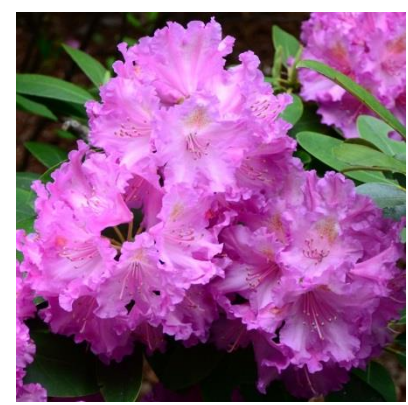
14. (Gov. Mansion x Wheatley)