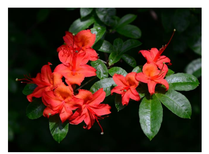
2019 Deciduous Azalea: R. cumberlandense

R. cumberlandense is one of our native deciduous azalea species. It was actually our third choice for a favorite deciduous azalea from those who responded to my request for preferences. Two other plants did score higher, the heat tolerant 'Admiral Semmes' which is a yellow Aromi hybrid and 'Kennell's Gold', a golden yellow R. austrinum hybrid from Transplant Nursery. They were not eligible because the cultivars have not been registered. Maybe next year! This species is a great plant, though, and flowers are usually orange to red. It is similar to, but blooms slightly later than, R. calendulaceum .