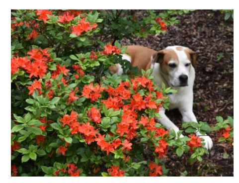
10. R. cumberlandense