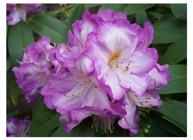
'Gilbert Myers' (2017)