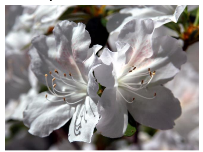
2019 Evergreen Azalea 'Treasure'

'Ken Janeck' is a reliable large leaf rhododendron (elepidote) that is assumed to be a R. yakushimanum hybrid although some question whether it may be a selection of the pure species. The plant is compact with excellent foliage. The flowers open soft pink and eventually fade to white. The leaf surfaces are white as they emerge due to "indumentum," fuzz that covers all surfaces. That fuzz eventually dusts off the top surface but remains underneath and the color changes from white to tan. It does discourage insects and makes foliage less palatable to deer.