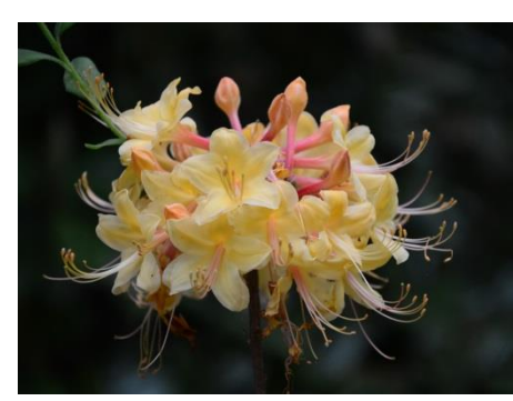
'My Mary' (2015)