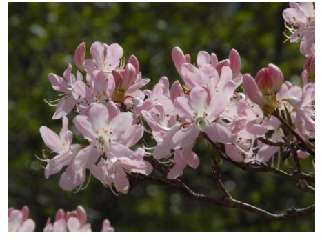
8. R. vaseyi