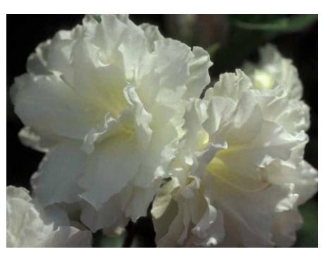
'Sandra's Green Ice' (2012)