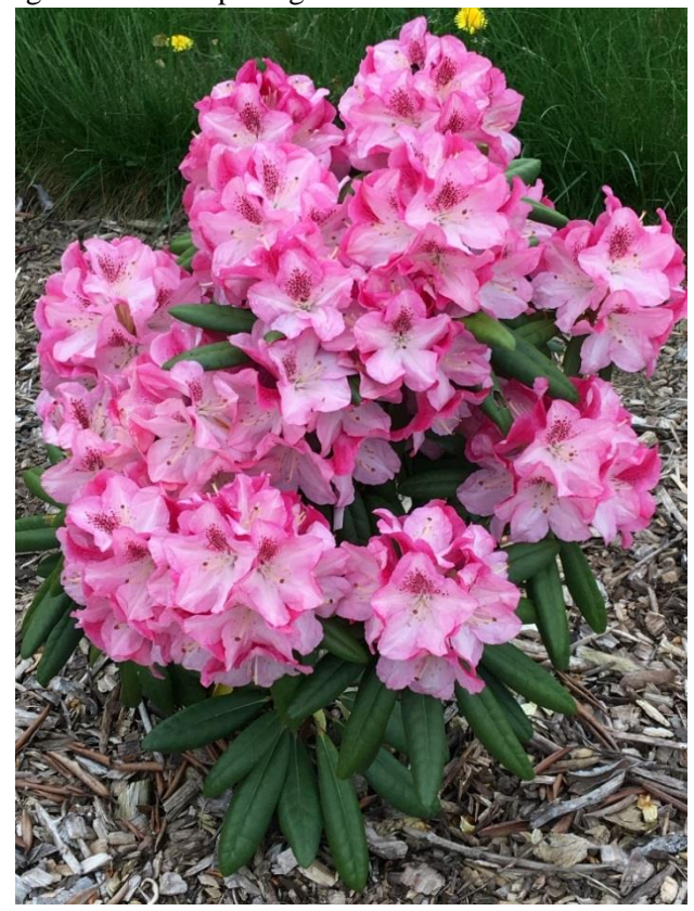
Southgate® Splendor<sup>™</sup> One of Steve's New Hybrids

Significantly, increased disease resistance also confers adaptability to warmer climates such as the Gulf South (hardiness zone 9), regions where culture of large leafed rhododendrons has heretofore been limited. Resistant cultivars can be grown on their own roots, or serve as rootstocks for grafting susceptible scions, and I will give an update on our evaluations of experimental and commercially available rootstocks that can provide protection against this soil pathogen.