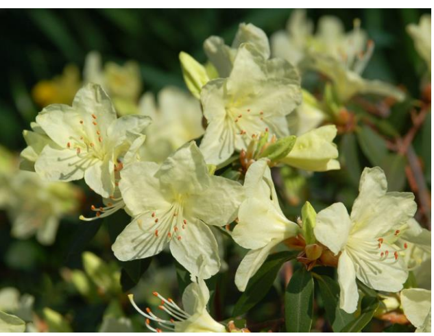
2020 Lepidote Rhododendron R. keiskei