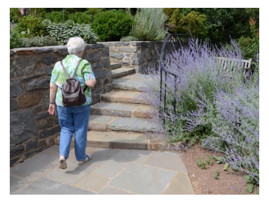
Russian Sage at the National Cathedral