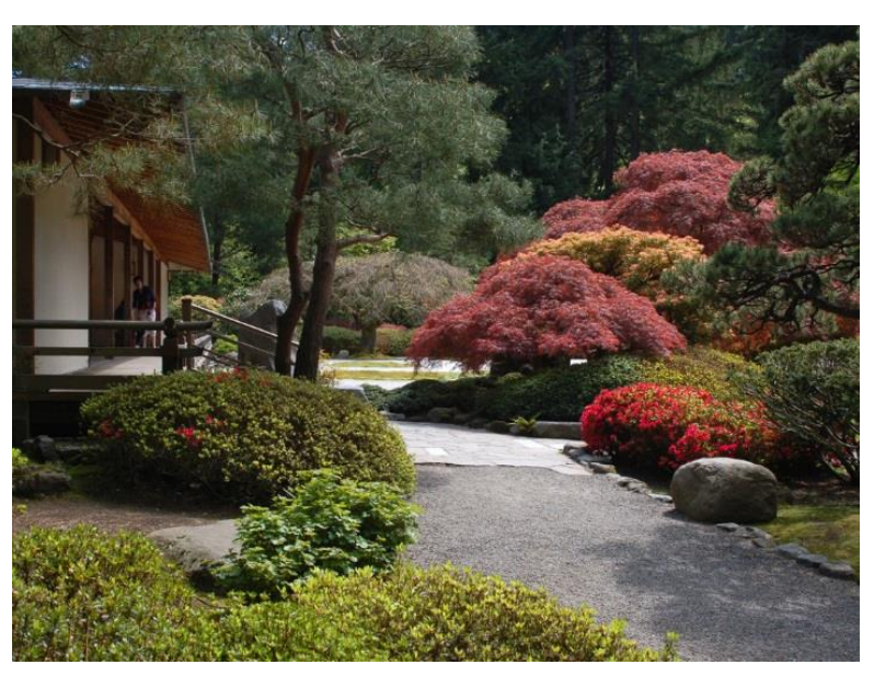
Japanese Garden - Pavilion and Maples