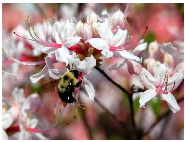
2020 Deciduous Azalea: R. periclymenoides

R. periclymenoides is one of the most common native deciduous azalea species in the Middle Atlantic region. It has been known as the "Pinxter Bloom" and some called them "Wild Honeysuckles" and has been highly prized for its light pink to white fragrant blossoms since Colonial times. Its delicate flowers and carefree habit still make a beautiful addition to any garden.