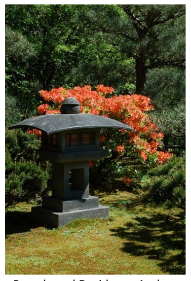
Pagoda and Deciduous Azalea