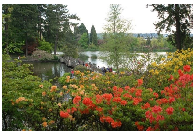
Crystal Springs - Deciduous Azaleas

This garden is on an island in the city of Portland and has been a display garden for the ARS.