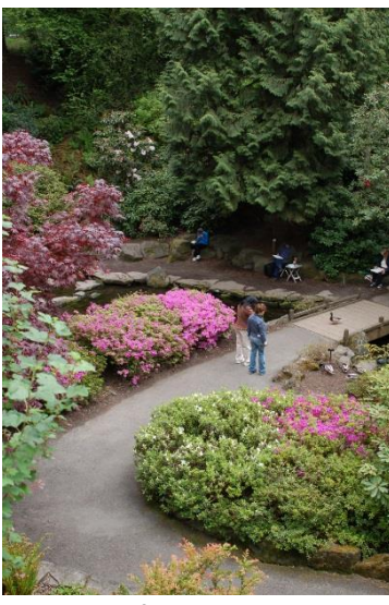
Vista from the Bridge