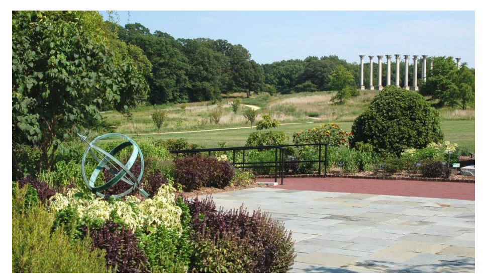
Vista from the National Herb Garden at the U.S. National Arboretum