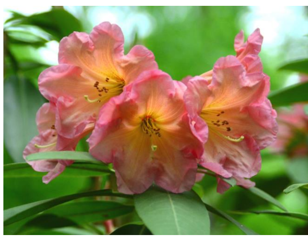
2020 Elepidote Rhododendron 'Bea MacDonald'