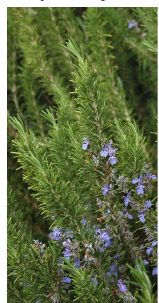
Rosemary at the Hermitage Museum and Gardens, Norfolk, VA