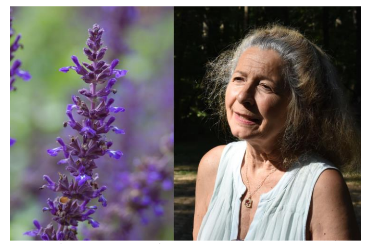
Sage 'Mystic Spires Blue'

https://www.bayweekly.com/category/article-category/features/gardening