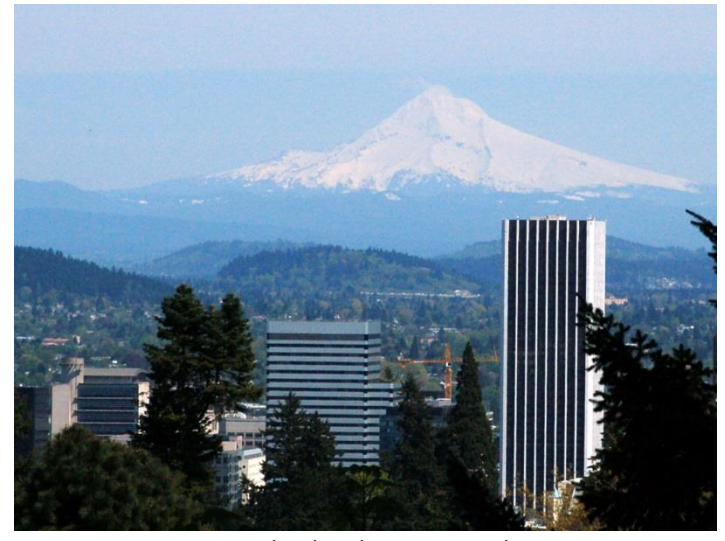
Portland and Mount Hood