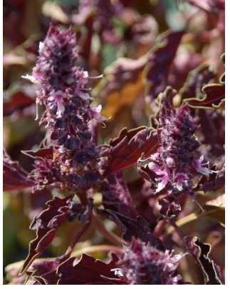
Basil 'Purple Ruffles'