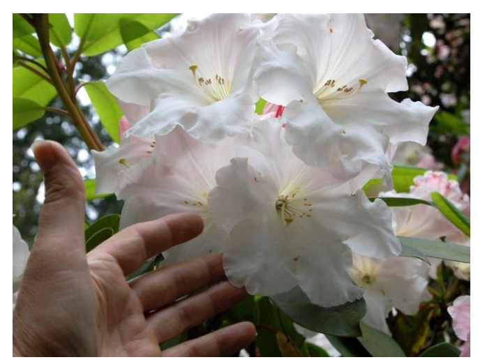
'Loderi King George'