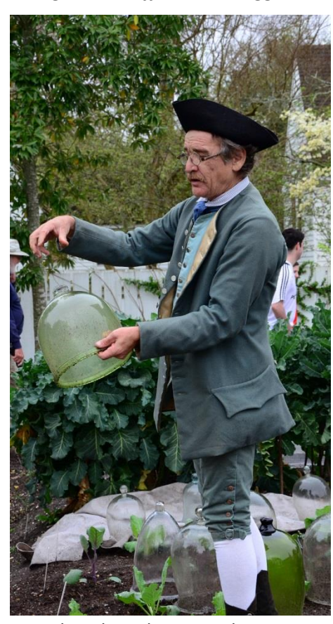
Colonial Gardening Techniques Williamsburg, VA