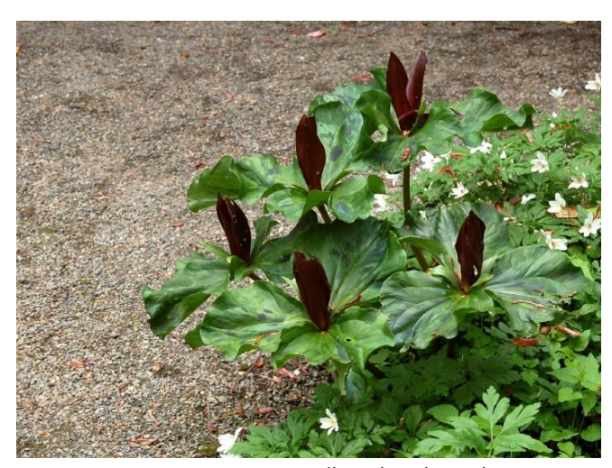
West Coast species Trillium kurabayashii