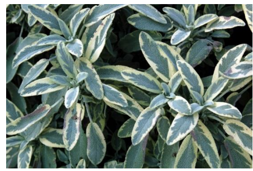
Sage: Salvia officinalis 'Berggarten'