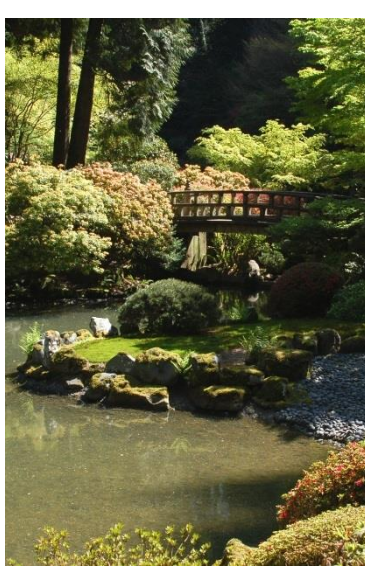
Bridge at the Pond Garden