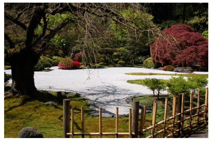
Japanese Garden - Vista in the Flat Garden

This is one of the finest Japanese Gardens in the US and has a very scenic setting on top of a foothill overlooking the city of Portland and Mount Hood.