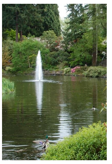
Crystal Springs - Fountain