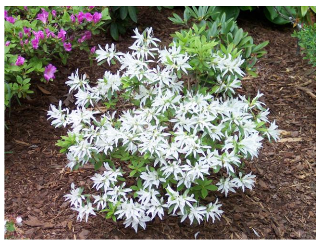
2020 Evergreen Azalea 'Wagner's White Spider'