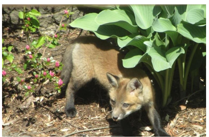
Last Year's Best Photo: "Fox and Azalea"