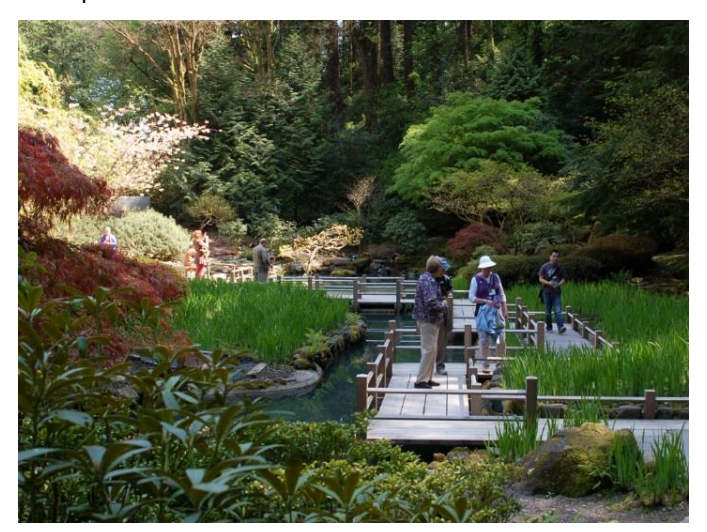
Japanese Garden - Decking at the Pond Garden