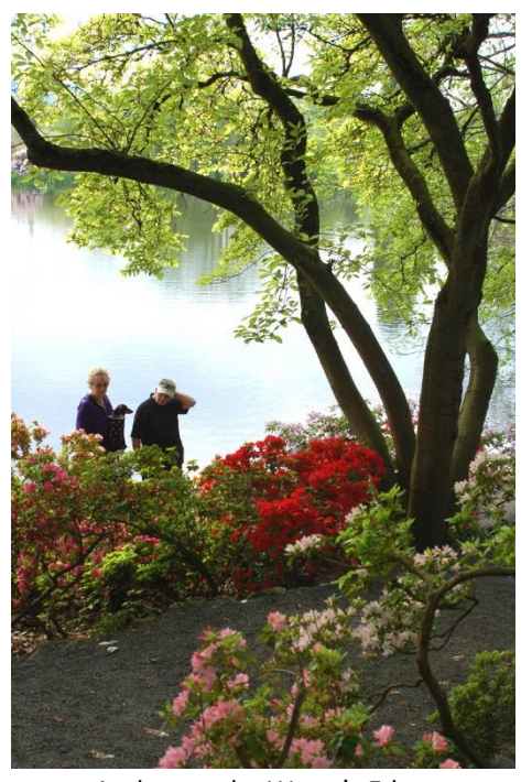
Azaleas at the Water's Edge