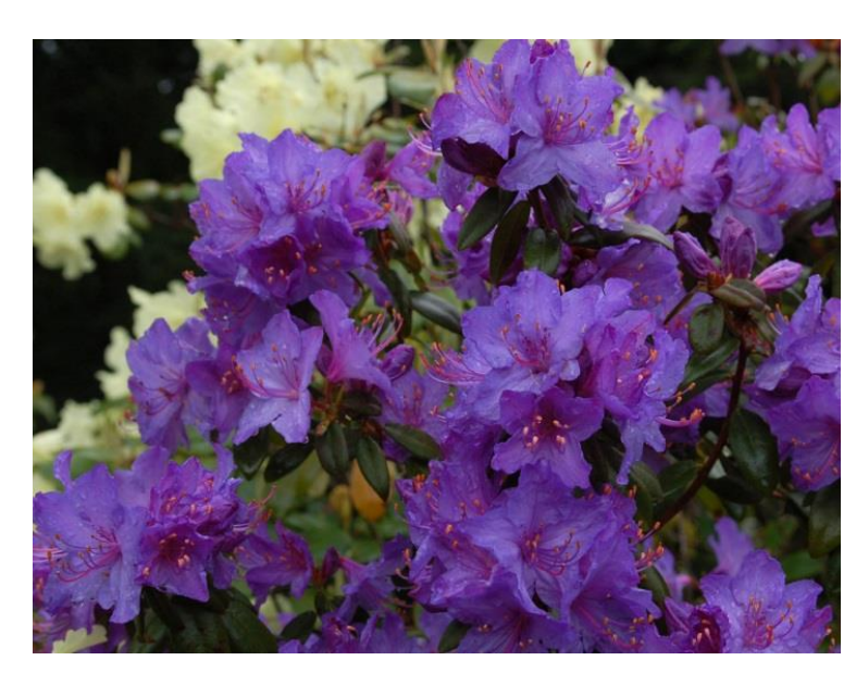
'Blaney's Blue' in the Stewart Garden