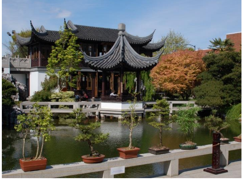
Chinese Garden – Pavilion and Tea House