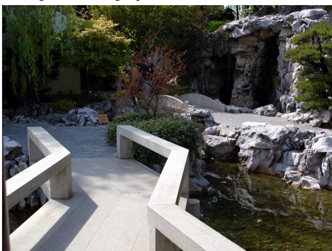
Chinese Garden - Bridge and Rocks

This is a pristine but small garden in the city of Portland that has carefully manicured plants in a setting surrounding a pond and scenic structures.