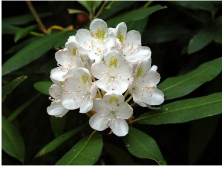
ECO-G-09 - Open understory conditions should be enhanced to provide the natural range of variation through a reduction in ericaceous shrubs, such as deciduous azaleas and mountain laurel, to benefit many species of birds, bats, and other animals.