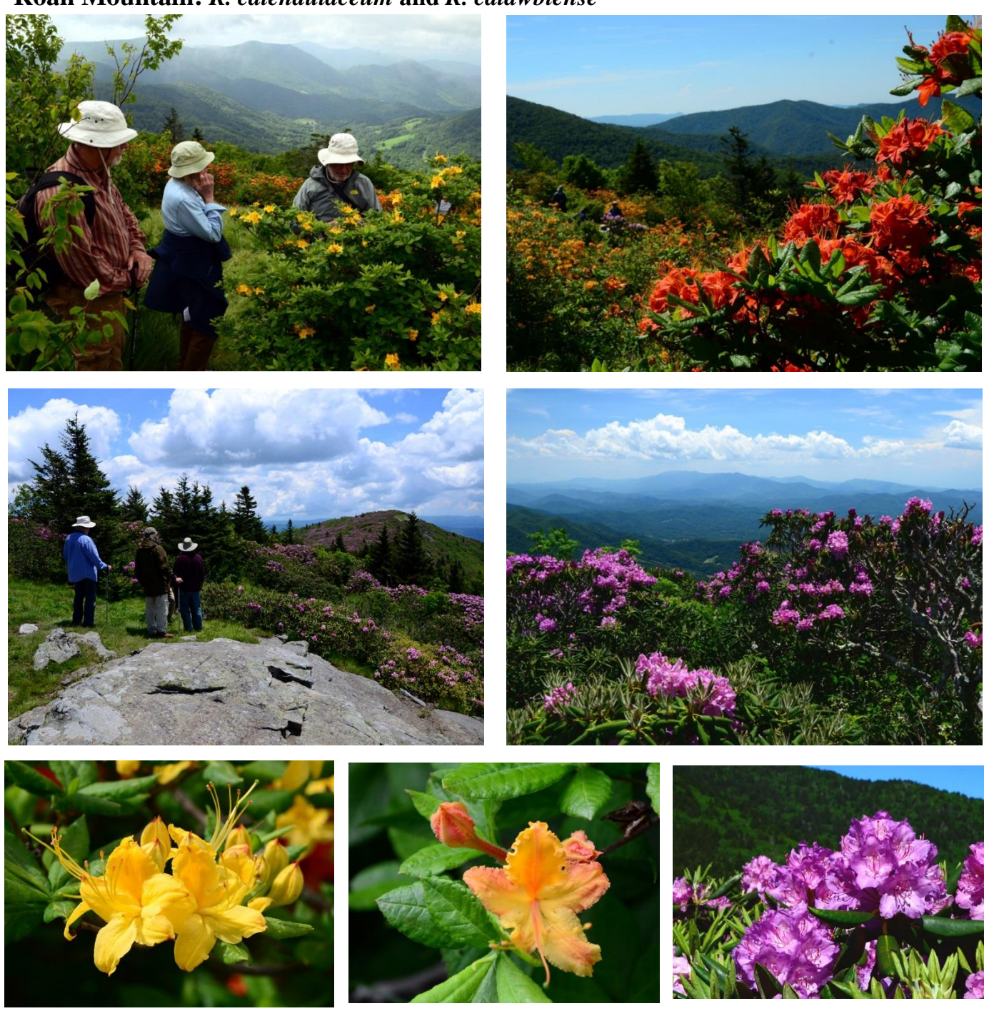
Mount Mitchell: R. maximum