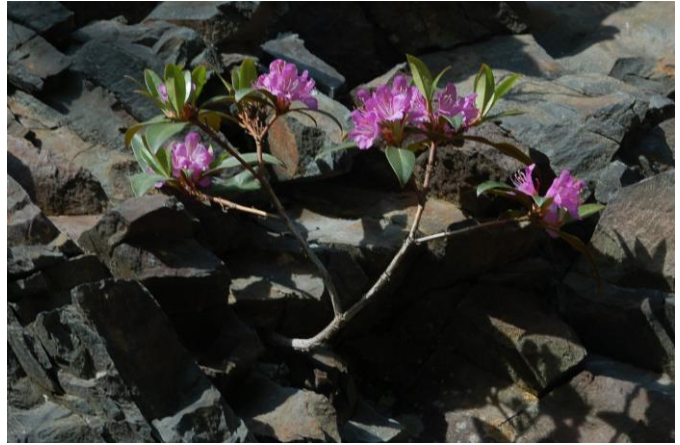
Rhododendron minus “smokianum”

It doesn’t look like the other forms of R. minus that we grow. The garden favorite we knew as “carolinianum” or R. minus Carolinianum group ( R. minus var. majus ) is larger than “smokianum” in both plant and flower. Its flat flowers have a totally different color range, primarily white to light lavender pink, and some have a contrasting yellow blotch. It blooms in early spring, at least 6 weeks ahead of “smokianum.” It doesn’t grow in the Smokies but can be found at comparable altitudes 50 to 100 miles away (80 to 160 km) to the north and east near both Mount Pisgah and Grandfather Mountain, the same narrow range where R. vaseyi grows.