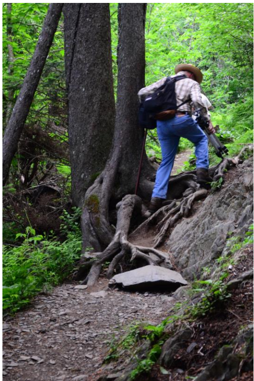
Karel Bernady climbs over rocks and roots on the Appalachian Trail to Mt. LeConte

Bald to catch the end of that display, we decided to hike out the Appalachian Trail to the Jump Off. There was a good chance we might see that area in peak bloom.