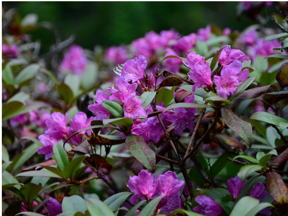
R. smokianum – Officially a New Species

and apply the filter. It will bring up images from five regions documenting his travels to see the species from 2015 to 2019. It is all in English! Thanks for your efforts, Ralf!