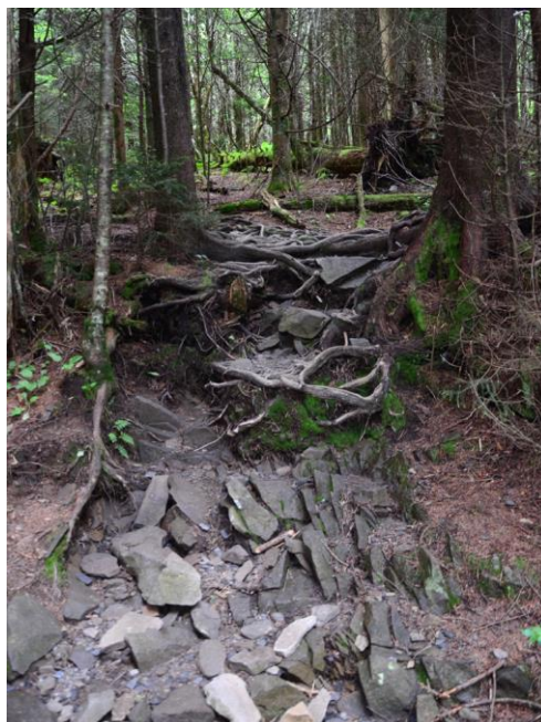
Side trail to the Jump Off

Soon I realized that going down some of those transitions was often more difficult than going up. A few years ago, I tore some ligaments in my knee when I slipped on ice. The weight I gained recently put additional stress on my knees. One has extra momentum on descents, and I envisioned rolling all the way to Gatlinburg if I should lose my balance!