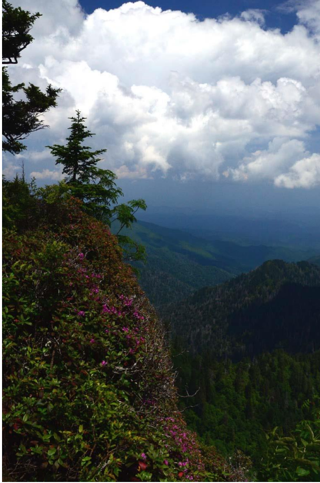
Vista from the Jump Off on Mt. Kephart with R. minus “smokianum”