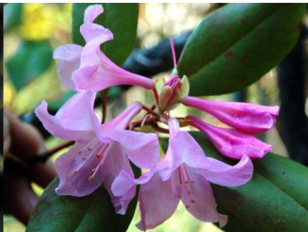
R. minus var. minus