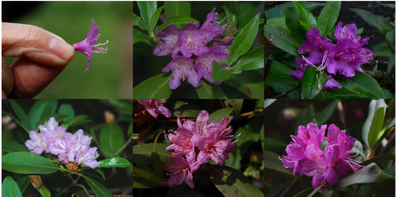
Some flower color variations of “smokianum”

To get to the larger populations of this rare rhododendron species requires a significant hike along the Appalachian Trail toward Mount LeConte, elevation 6,594 ft (2,010 m). I have seen pictures of the dwarf purple minus in that area. However, to get to Mt. LeConte and back is a two-day hike round trip. There are cabins at LeConte where one can spend the night but they must be reserved well in advance.