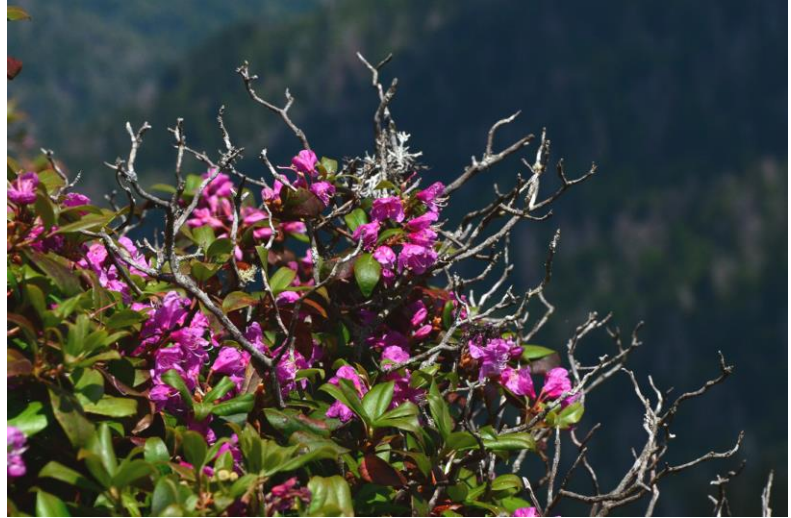
Looking over the cliff to the valley below, a 1000 ft Drop

We reached the Jump Off about noon. It was gorgeous vista with breathtaking views, billowing clouds, and the purple minus was in full bloom. Some plants did have dead branches, but it wasn't winter damage this year but possibly some past drought. I gazed over the edge a number of times but held firm to my glasses. I had lost them once on Roan, and if I dropped them here there was no hope of retrieval. I am not fond of heights so overcoming that fear was another personal challenge.