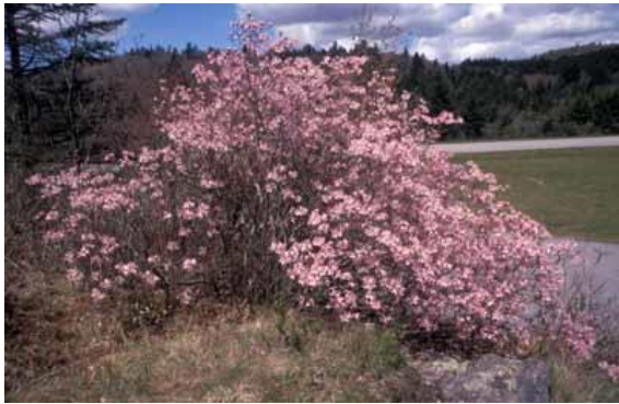
GKM-10-DevilsCourthouse.jpg (Plant at Devils Courthouse Overlook)