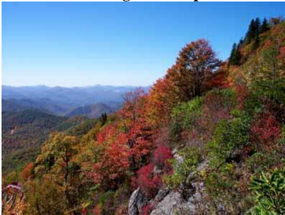
DWH-31-BRP425-Autumn.jpg (Milepost 425 in October)