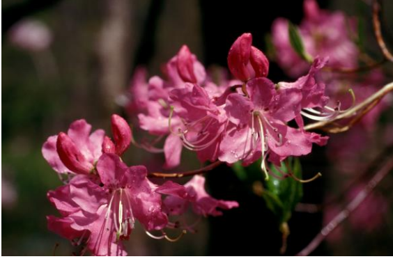
DWH-07-RedVaseyi.jpg (Deepest color form we have seen in the wild)