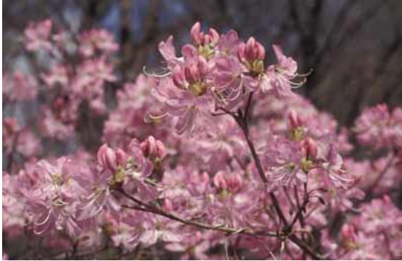
DWH-01-Pink-BRP417.jpg (Strong pink near Milepost 417)