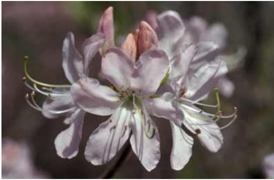
DWH-09-SixPetals.jpg (Blush with six petals)