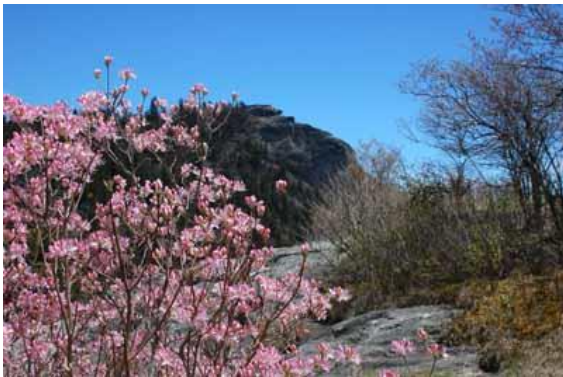
DWH-21-DevilsCourthouse.jpg (Devil's Courthouse Overlook)