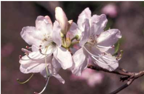
GKM-06-BRP419-White.jpg (White with pale pink buds)