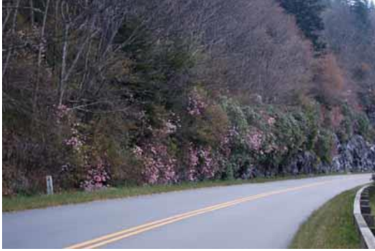
DWH-29-BRP425.jpg ( R. vaseyi at Milepost 425)