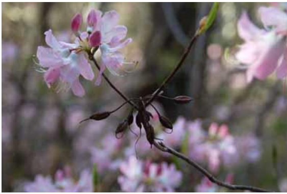
DWH-05-Seedpods.jpg (Flowers but showing previous year's seedpods)