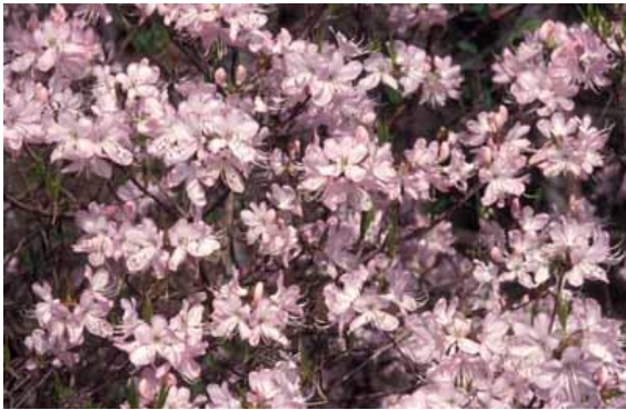
GKM-05-BRP417-Blush-RoundedFlowers.jpg (Blush near Milepost 417)