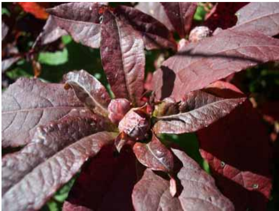
DWH-33-MultipleBud.jpg ( R. vaseyi with multiple buds on terminal shoots)