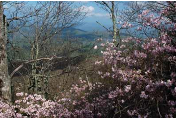
DWH-25-PilotMountain.jpg (View of Looking Glass Rock from Pilot Mountain)