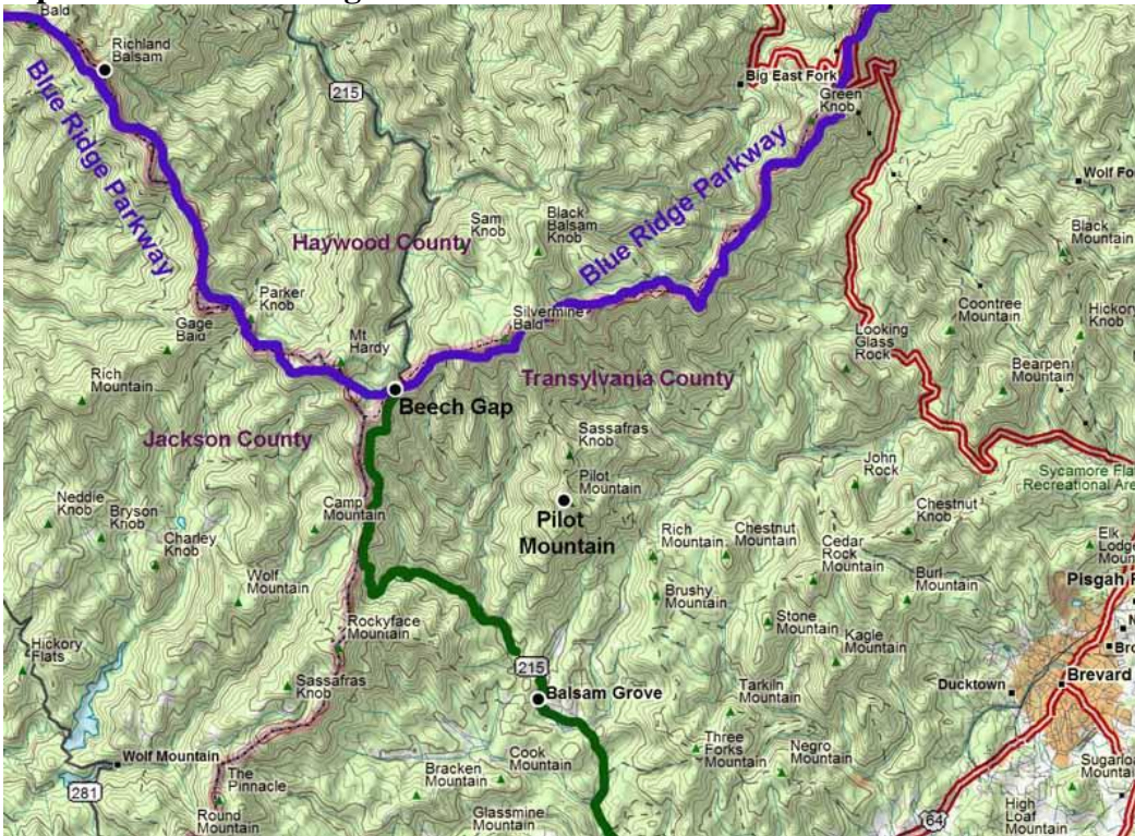
DWH-41-BlueRidgeParkway-Map.jpg (Map of southern regions – DeLorme Topo USA 4.0)