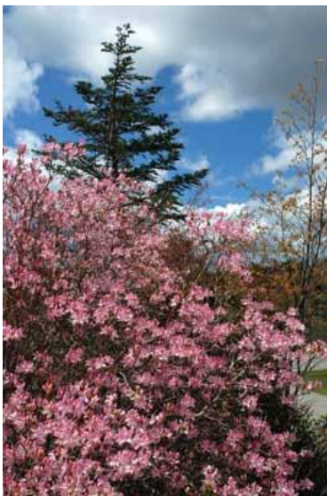
DWH-22-DevilsCourthouse.jpg (Devil's Courthouse Overlook)