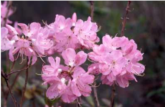
GKM-02-BRP419-PinkRoundFlowers.jpg (Good form)