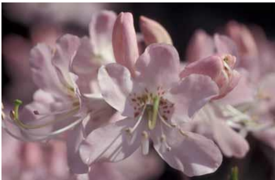
DWH-03-BlushPink.jpg (Brown Blotch)