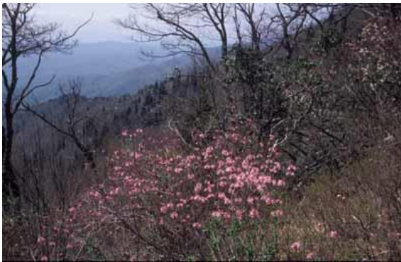
GKM-23-JohnRock.jpg (John Rock Overlook)