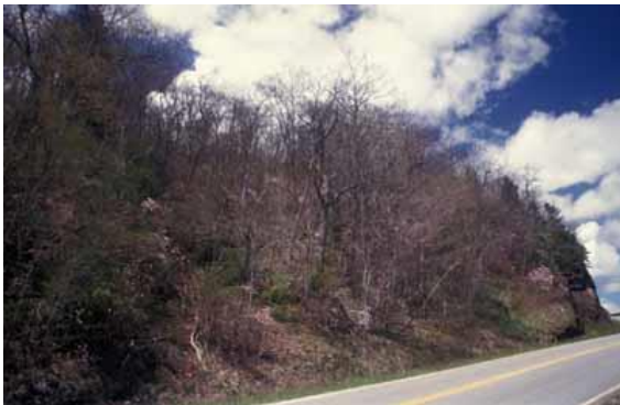
GKM-21-Rt215.jpg (Hillside on Route 215)