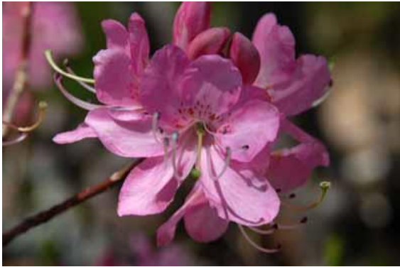
DWH-08-SixPetals.jpg (Bright pink with six petals)