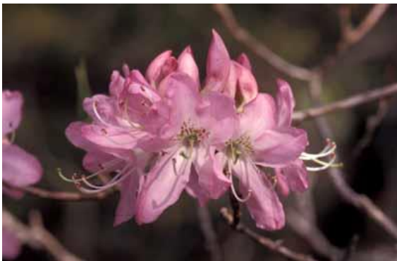
GKM-03-BRP419-Pink.jpg (Pink with lighter center, greenish brown blotch)