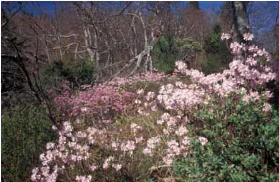
GKM-20-JohnRock.jpg (Variations at John Rock Overlook)