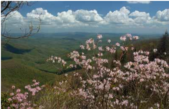
DWH-27-ParkwayView.jpg (Parkway view near Milepost 423)