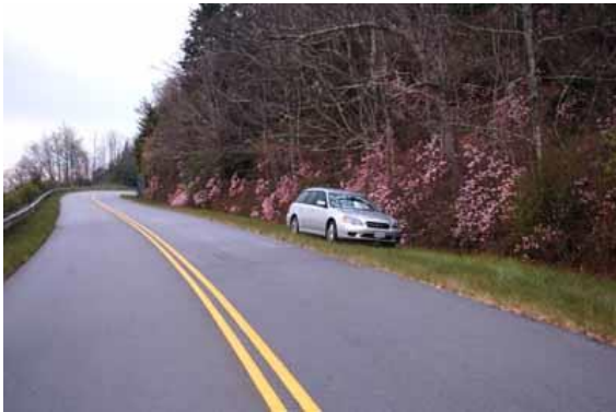
DWH-30-BRP-425.jpg (Easy Parkway access at Milepost 425)