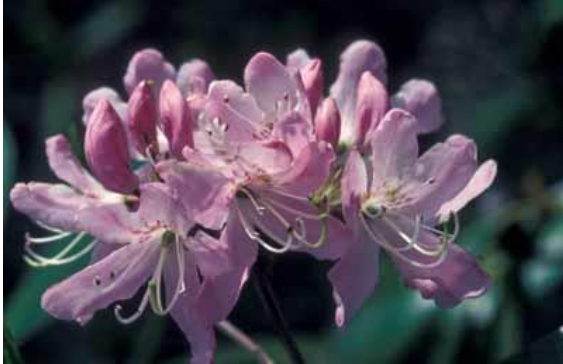
GKM-01-BRP342-YanceyCounty.jpg (Five and six-stamen flowers)