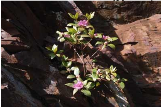
DWH-36-LateMinus.jpg (Late Purple R. minus )