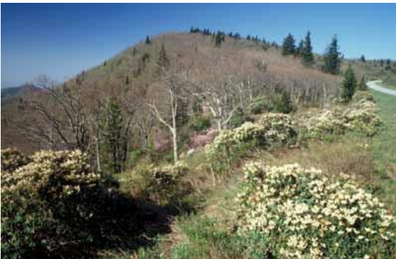
GKM-26-JohnRock-Fetterbush.jpg (John Rock Overlook with Mountain Fetterbush)