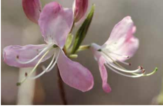
DWH-10-ThreePetal.jpg (Flowers with three petals)