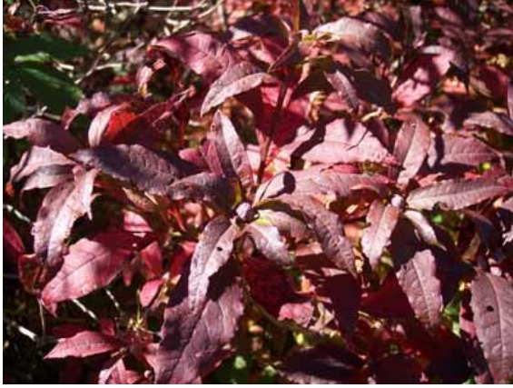
DWH-32-FallFoliage.jpg (Fall Foliage of R. vaseyi )