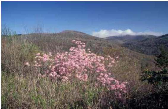
GKM-11-GraveyardFields.jpg (Plant near Graveyard Field Overlook)