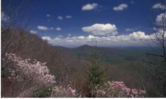
GKM-28-ParkwayView.jpg (Parkway View near Milepost 423 –Pilot Mt. is centered in distance)