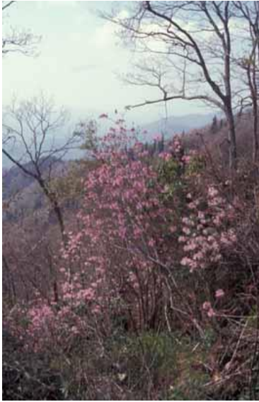
GKM-22-JohnRock.jpg (John Rock Overlook)