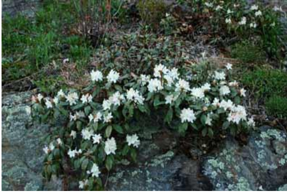
DWH-35-MinusCarolinianum.jpg (Early White R. minus v. carolinianum )