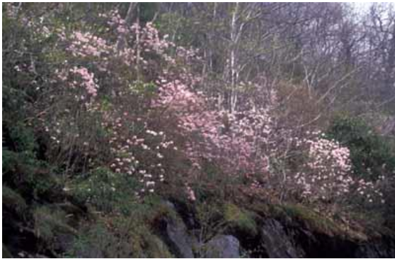
GKM-13-BRP425-Habitat-Seeps.jpg (Milepost 425 – Notice underground seeps)