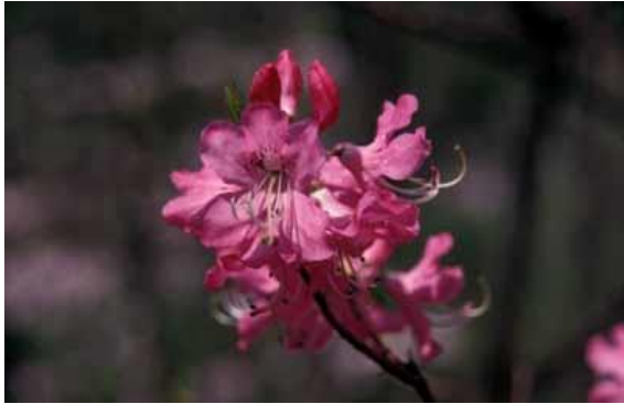
GKM-08-RedVaseyi.jpg (Deepest color R. vaseyi we have seen)