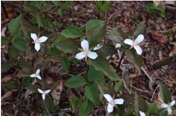
DWH-34-TrilliumUndulatum.jpg (Painted Trillium on Pilot Mountain)