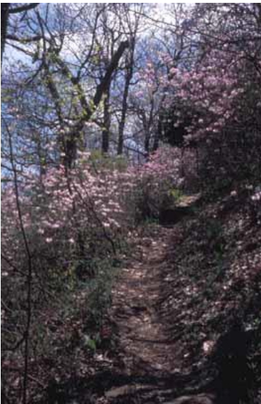
GKM-27-PilotMountain.jpg (Pilot Mountain Trail)