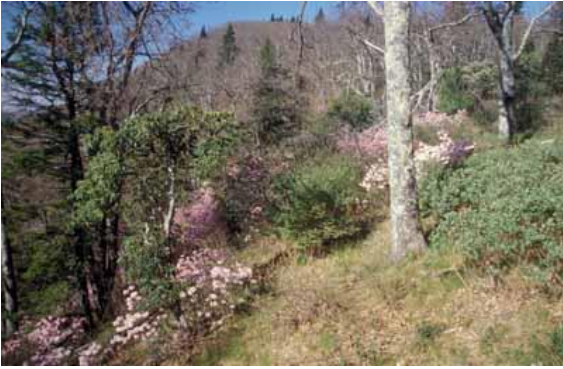
GKM-25-JohnRock.jpg (John Rock Overlook)