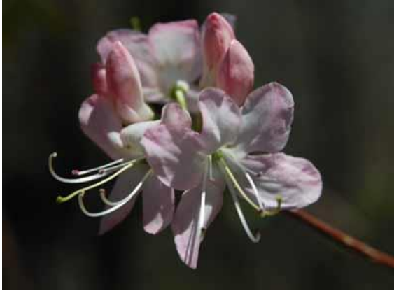
DWH-04-StamenTypes.jpg (Pale pink - good example of dimorphic stamen types)