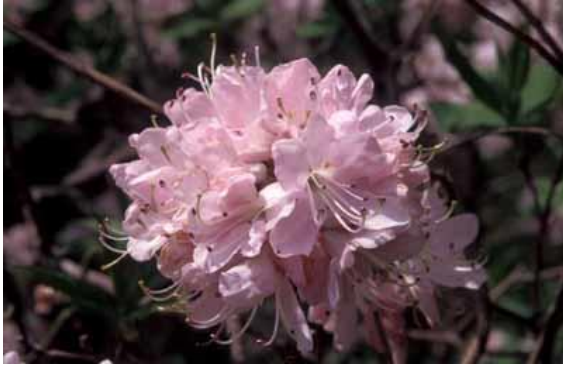
GKM-04-BRP415-BallTruss.jpg (Multi-bud, ball shaped truss and flower with 7 stamens)