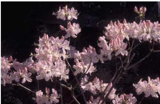
GKM-07-BlushPink.jpg (Pale color contrasting against rock cliff)