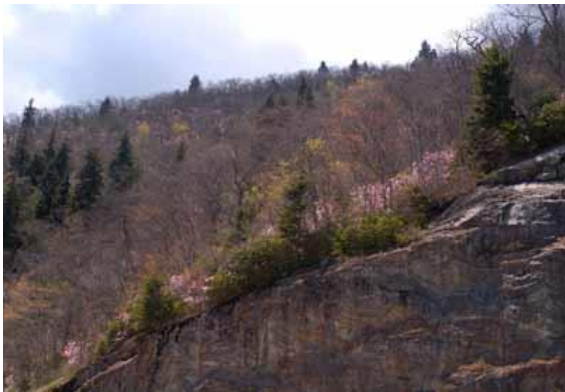
DWH-28-Rt215.jpg (Hillside and cut off of Route 215)