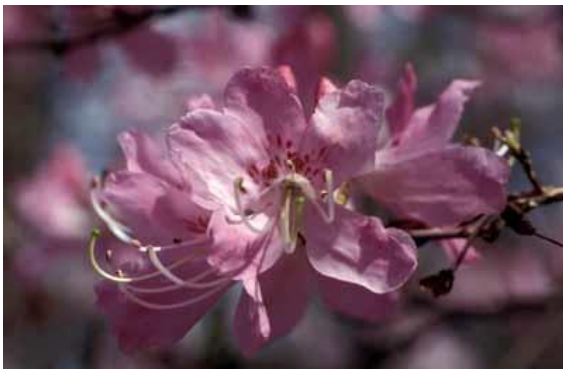
DWH-02-Pink-RedBlotch.jpg (Pink with Red Blotch)