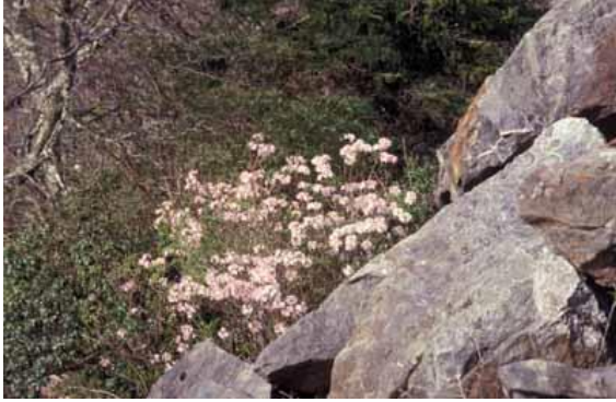
GKM-12-BRP419.jpg (Rock and plants at milepost 419)