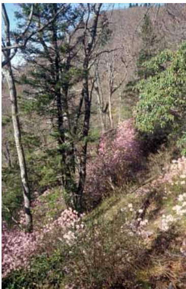
GKM-24-JohnRock.jpg (John Rock Overlook)