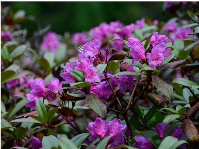
R. minus "smokianum"

Viewing these plants in the wild convinces me that the purple minus deserves its own unique identity. It is very different from any of the other lepidote forms we see.