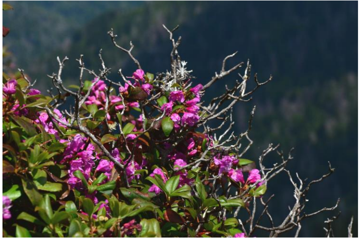
Looking over the Cliff to the Valley Below, a 1000 ft Drop

Most of the prime viewing spots have room for only one or two people, so it is important to go with a small group rather than a big crowd. In the image below, Karel is using his tripod to hold the camera over the edge of the cliff while George was operating the cable to snap pictures. If you look at the ground about 2 ft from where they are standing, you can see where someone stepped too close to the edge and it had given way.