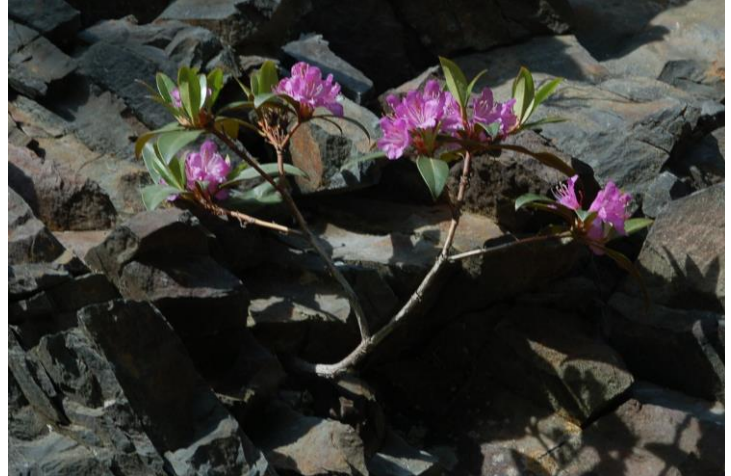
Rhododendron minus “smokianum” Growing on a Rocky Cliff

None of our native lepidotes come in the purple shades we see with “smokianum.” Its flowers are small, less than an inch across (2.5 cm), and can be widely funnel shaped to more narrowly