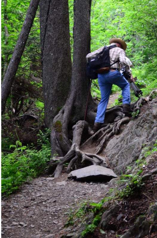
Karel Bernady Climbs over Rocks and Roots on the Appalachian Trail

The strange weather patterns this year caused us to miss much of the native azalea and rhododendron display we normally admire in mid to late June. However, that gave us an opportunity to search for other plants including “smokianum.” Rather than hiking up to Gregory Bald to catch the end of that display, we decided to hike out the Appalachian Trail to the Jump Off. There was a good chance we might see that area in peak bloom.