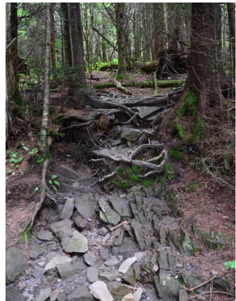
Side Trail to the Jump Off

It is a very pretty trail but challenging in places, harder than anything we encounter on the Gregory hike. The round trip is only about half the distance of our Gregory Bald trips, but it seemed every bit as exhausting. This trip requires good hiking gear... heavy boots, hiking poles, and plenty of fluids to drink on the trail. The round trip took us nearly 7 hours, and we were sore and tired when we finished.