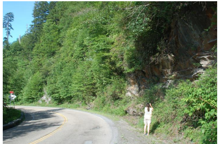
Photographing “Smokianum” on the Cliffs along Rt. 441